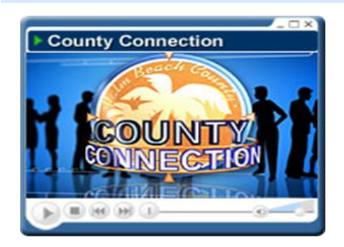
Click above to see a preview of the show or visit:

mms://pbcvideo.co.palm-beach.fl.us/pzb/ PBC ULDC Regulation.wmv