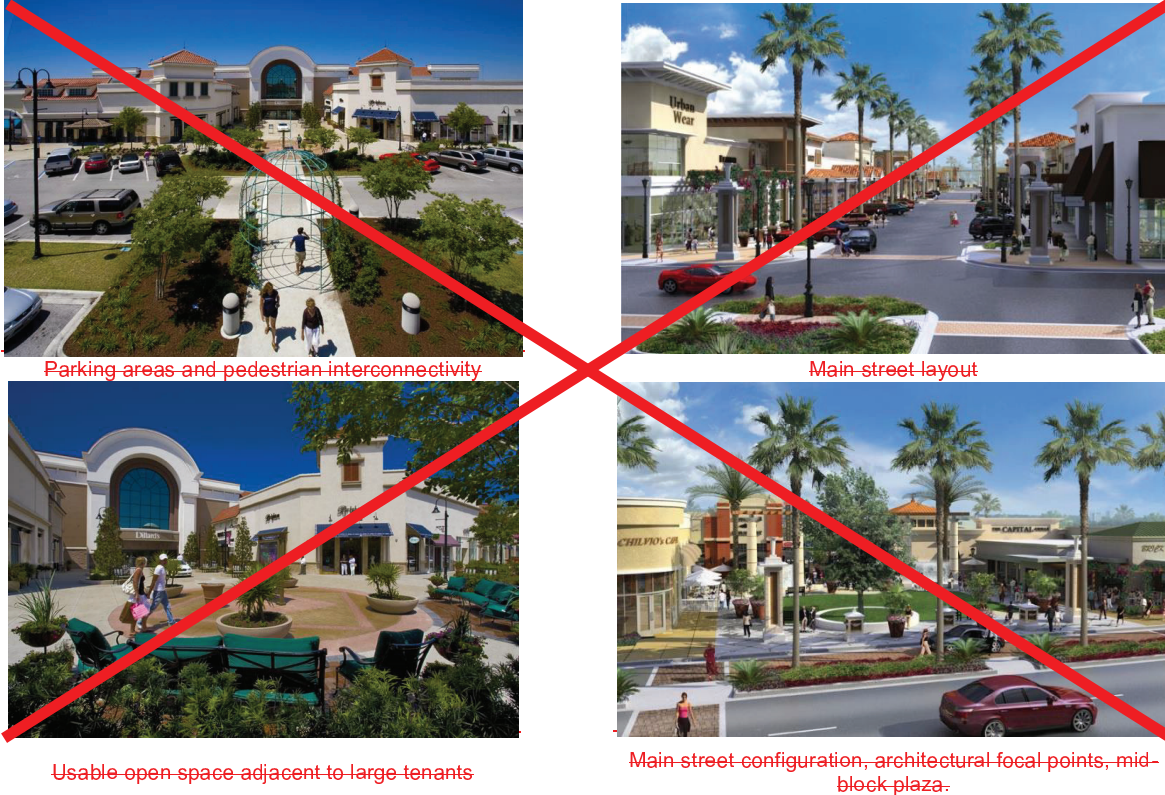
Parking areas and pedestrian interconnectivity