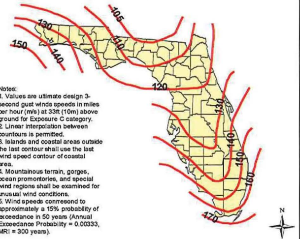
Figure 1609C Ultimate Design Wind Speeds, for Risk Category I Buildings and Other Structures

For Risk Category II buildings and structures and occupancy category III buildings and structures, except health care facilities, the windborne debris region shall be based on Figure 1609.1A. For occupancy category IV buildings and structures and occupancy III health care facilities, the windborne debris region shall be based on Figure 1609.1B.