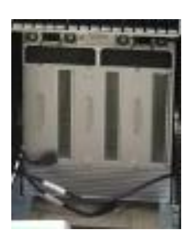
Front of Rack

One Brocade Storage Director 12 slots, 4 - FC8-48 boards, 8Gb 48 Port Blades populated with (a total of 192) LC-Shortwave-SFP-Pluggable Fiber Optic Transceivers. Approximate total weight 250 lbs.