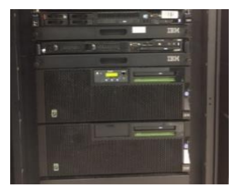
Close up of Two Data Domain ES20 Shelves, IBM 570, two IBM 7042 and two 7316 Consoles

IN ACCORDANCE WITH THE PROVISIONS OF ADA, THIS DOCUMENT MAY BE REQUESTED IN AN ALTERNATE FORMAT