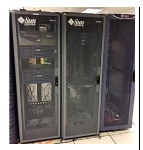
Front of Racks

Two Sun StorEdge (P/N 5954706) 19 Inch Racks with 2 Power Sequencer Distribution Units (P/N 3001393). One SunFire V280R server (A35-WSPF2-2GQBIOS) with 2-900Mhz Sparc III processors, 2GB memory, 2-36 GB 10K rpm drives (5404525-01), DVD Drive, 2 internal 10/100 Mb Ethernet ports, 1 - dual port 1/2/4Gb Fiber Channel adapter and 1 10/100/1000 Mb Ethernet Adapter. Two SunFire V440 Servers (A42-XAB2-04GD) 2-1.062Ghz Sparc IIIi processors, 4 GB RAM, 4-36GB 10K RPM Disk Drives (5405462-01), Internal 10/100/1000 Mb Ethernet ports. One system has a dual 2 Gb Fiber Channel adapter. Five StorEdge S1 Array Low Voltage Differential/Single Edge SCSI (LVD/DE) each with 3-36GB 10K rpm Ultra320 Hard drives (5404904-01). One - Sun 900-38 (P/N 5957128) 19 Inch Rack with Power Distribution Option SR9-XKM038A-IP. Approximate total weight 1400 lbs.