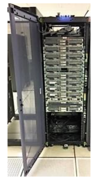
Front of Rack with view of D240s