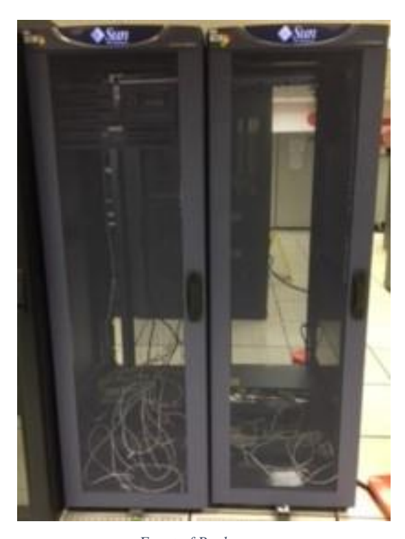
Front of Racks