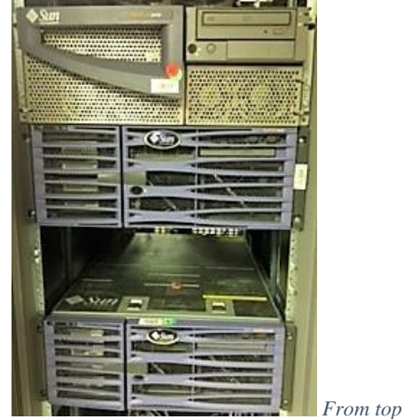
to Bottom - 280R, and two 440s