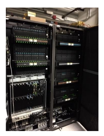
Front of USPV with doors open