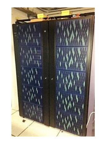
Front of USPV with doors closed