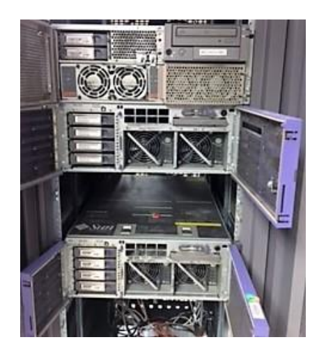
View of Internals - From top to Bottom - 280R, and two 440s