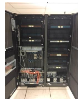
Front with doors open