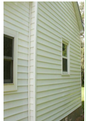
Before and After Vinyl Siding soft wash

MaBright & Clear Soft and Pressure Wash (561) 932-7594