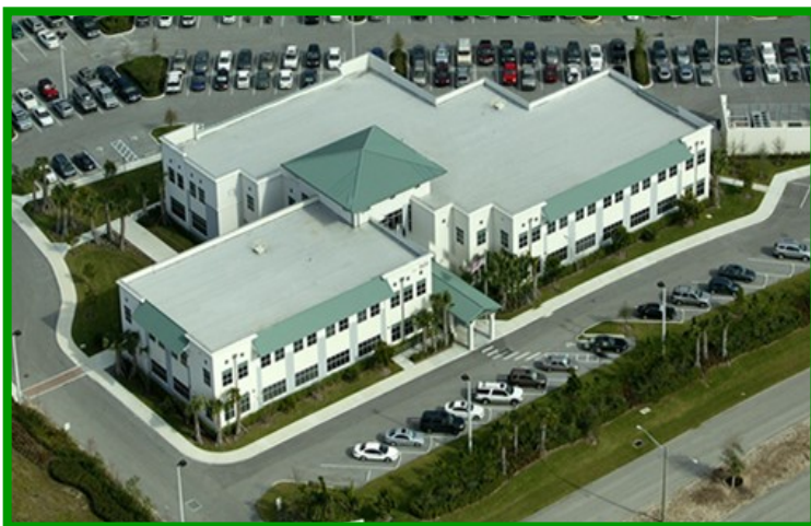
Aerial view of the FD&O building at 2633 Vista Parkway, West Palm Beach,.

FD&O is comprised of seven main divisions: Strategic Planning, Business Operations, Facilities Management, Capital Improvements, Property and Real Estate Management, Fleet Management Services, and Electronic Services & Security. Additional information regarding FD&O operations and the multiple services it provides can be found by visiting https://discover.pbcgov.org/fdo/Pages/default.aspx .