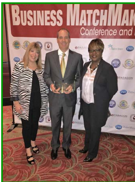
2015 SBE Business of the Year

Their core values of Safety, Integrity, and Accountability drive their daily decision-making and assist them in maintaining their commitment to delivering exceptional projects while maintaining social responsibility. LEBOLO takes responsibility for all processes and services rendered. Clients appreciate their “Open Book” approach and straightforward assessment of costs and timelines. They become an extension of their clients' staff, consistently delivering projects on time and within budget.