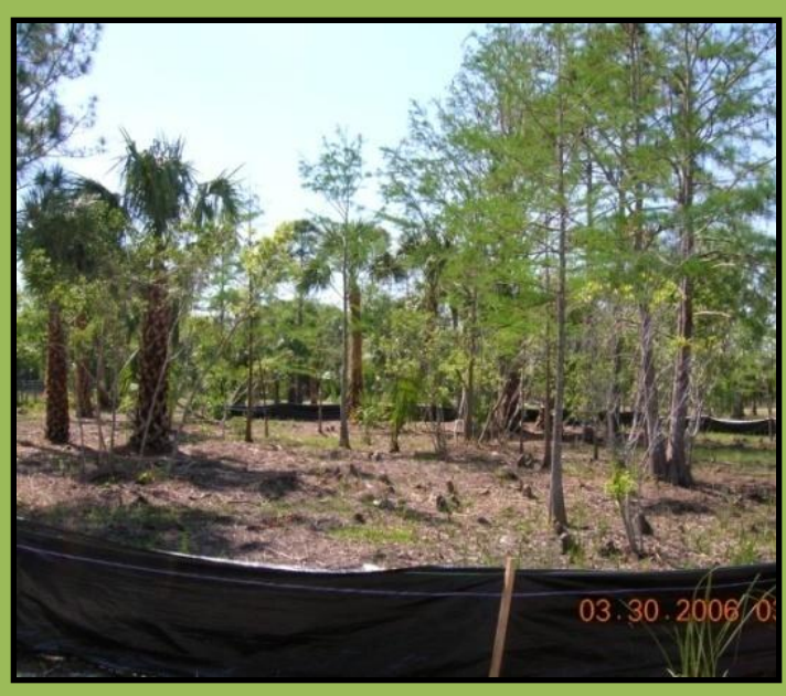
Cypress stand with barricading