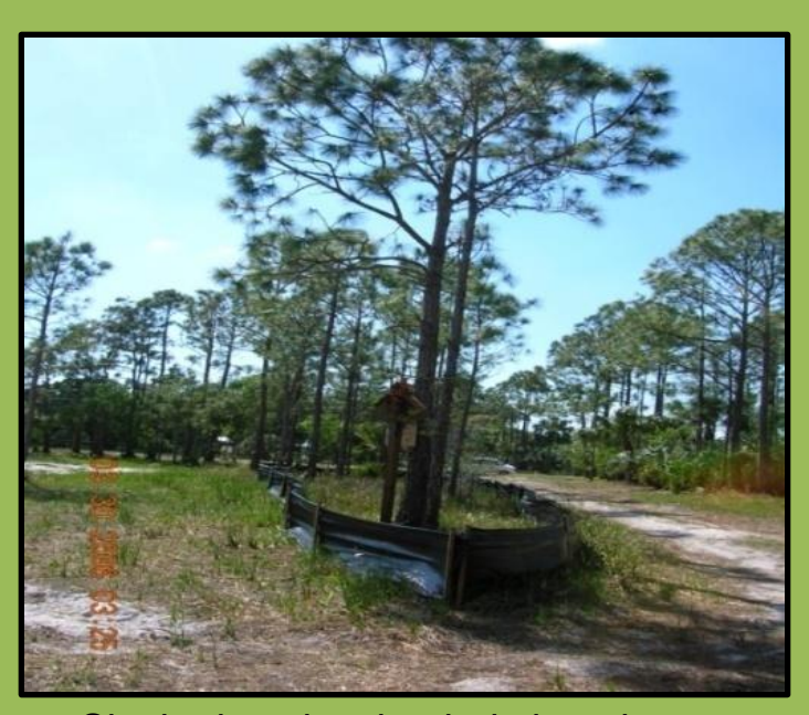
Slash pines barricaded along heavy equipment route

Not enough can be said about the importance of properly barricading your native vegetation.