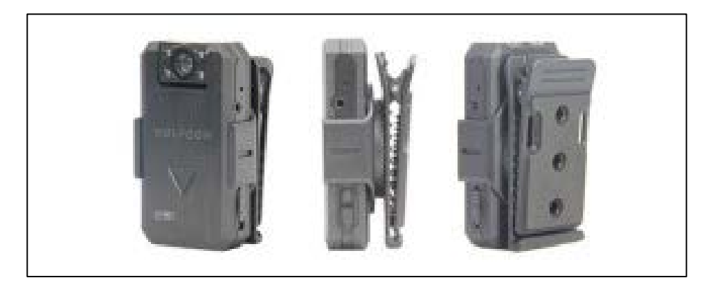
Figure 62. WOLFCOM Vision