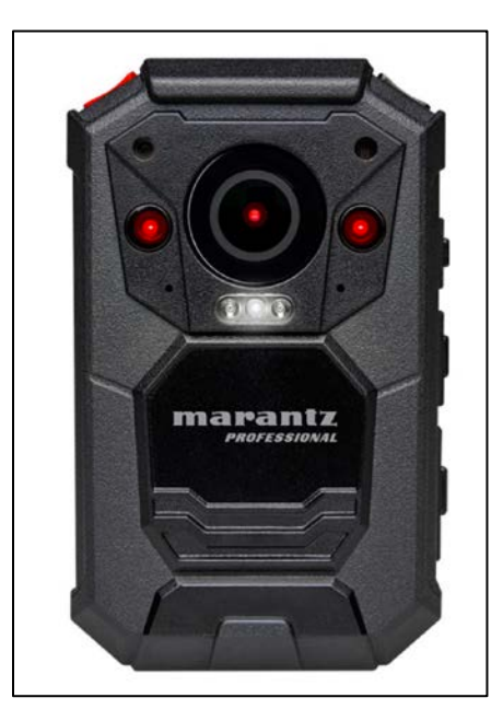
Figure 23. Law Systems Witness BWC