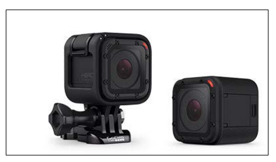
Figure 17. GoPro Hero4 Session