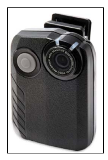
Figure 9. Data911 Verus BX1 Body Camera