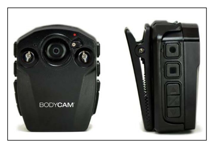
Figure 45. PRO-VISION BodyCam