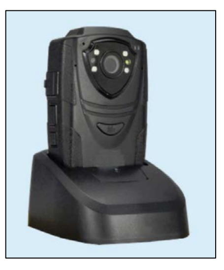
Figure 20. HD Protech CITE M1G2