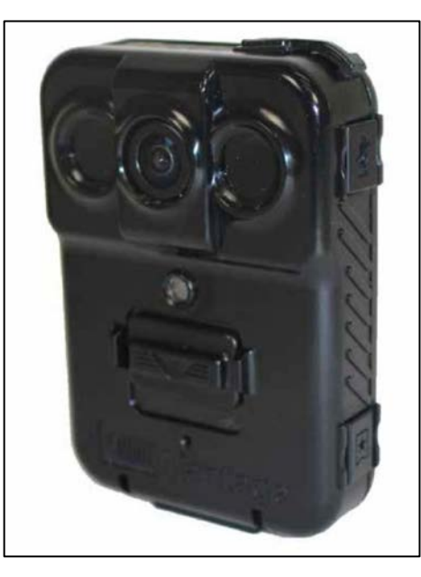
Figure 21. Kustom Signals Eyewitness Vantage