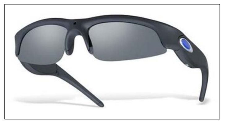
Figure 41. Primal USA DutyEGS Evidence Gathering Sunglasses