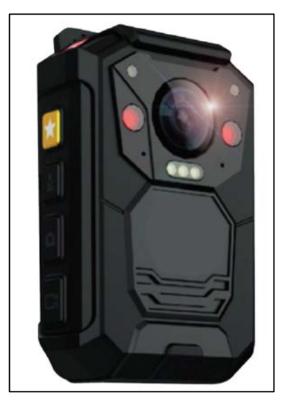
Figure 18. HauteSpot HauteVIEW 100