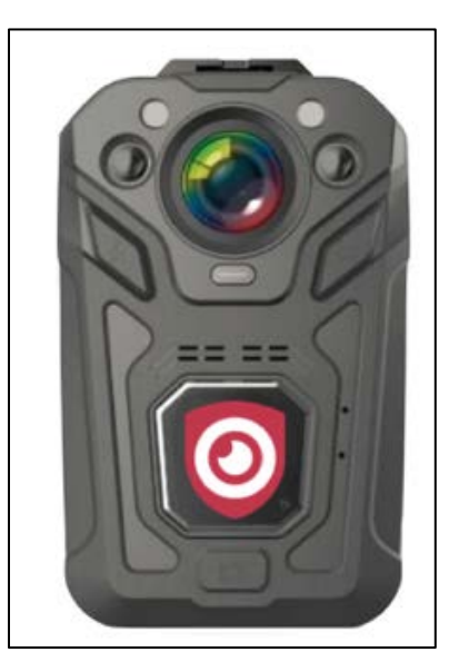
Figure 43. Primal USA DutyVUE PrimeOBSERVER II