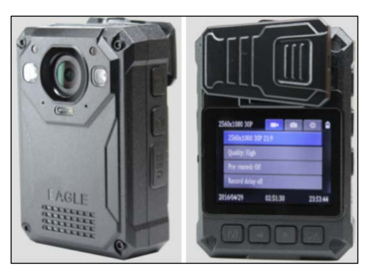
Figure 15. Global Justice Eagle NextGen