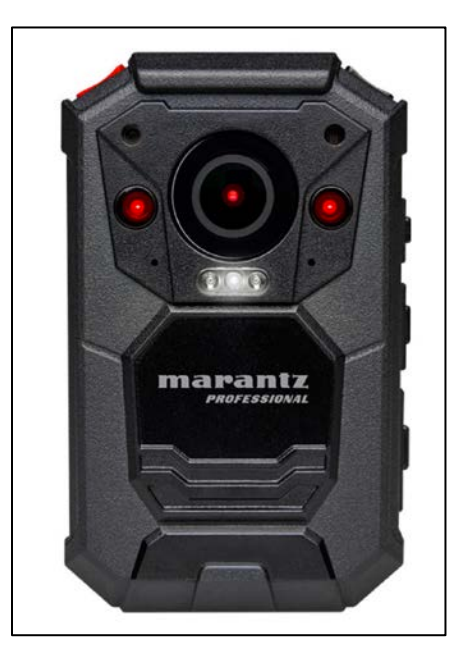
Figure 24. Marantz Professional PMD-901V