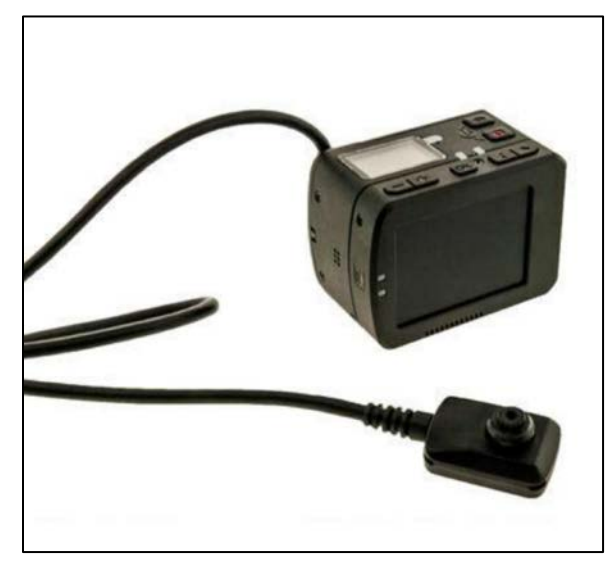
Figure 5. BrickHouse Security HD WiFi Police Button Camera