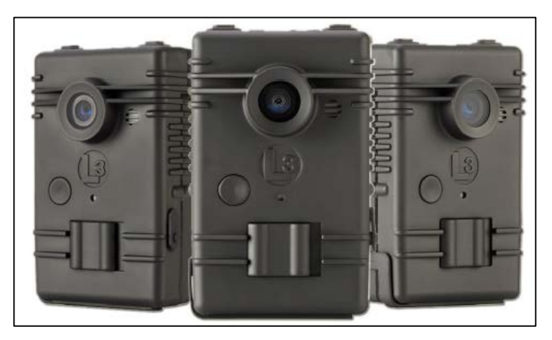
Figure 22. L-3 Mobile-Vision BodyVision XV