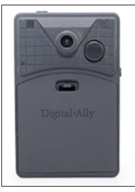
Figure 12. Digital Ally FirstVu HD One Body Worn Camera