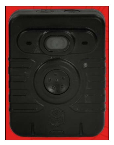
Figure 47. Safety Innovations VidCam VX