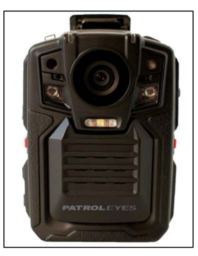
Figure 31. Patrol Eyes SC-DV5