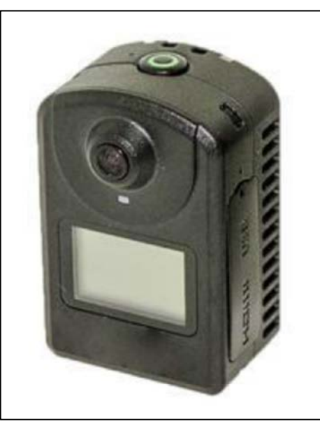
Figure 4. BrickHouse Security Ultra Compact HD WiFi Camera