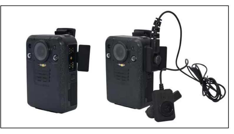
Figure 42. Primal USA DutyVUE PrimeOBSERVER I