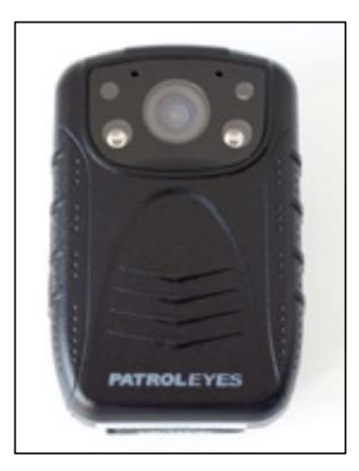
Figure 30. Patrol Eyes SC-DV1