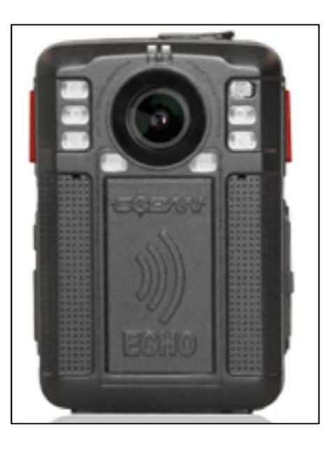
Figure 8. COBAN Body Camera