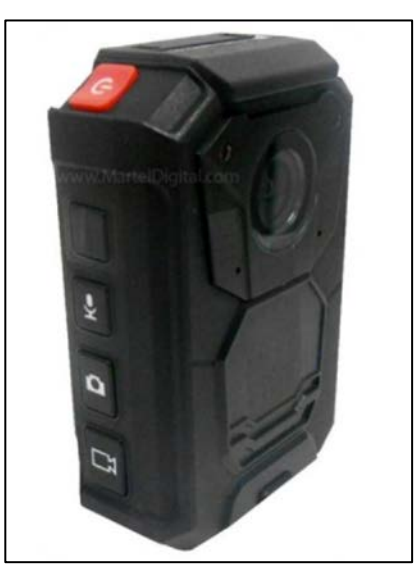
Figure 25. Martel Frontline Cam