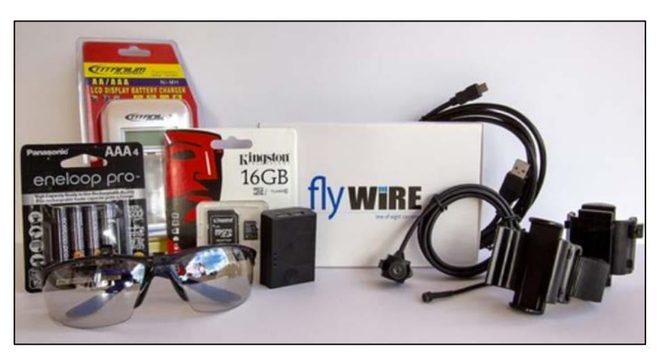
Figure 14. FlyWire Glasses Worn Security Cam Kit