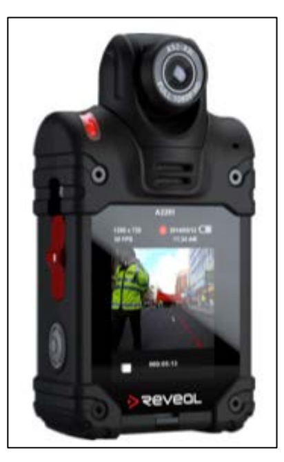
Figure 46. Reveal Media RS2-X2L