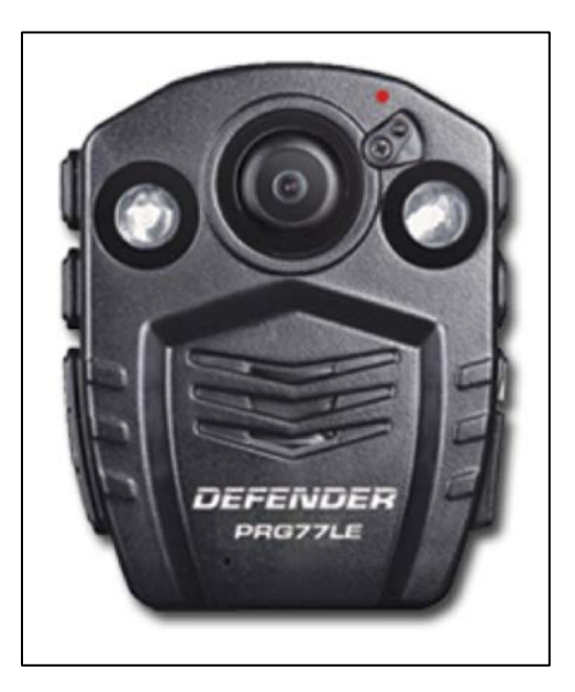
Figure 40. PRG 77LE Defender Body Worn Camera