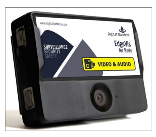
Figure 7. Brimtek EdgeVis VB340W