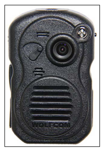
Figure 61. WOLFCOM 3<sup>rd</sup> Eye