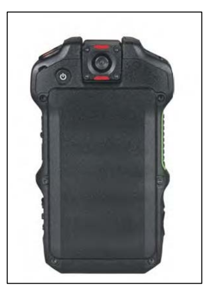
Figure 27. Motorola Si300 Video Speaker Microphone