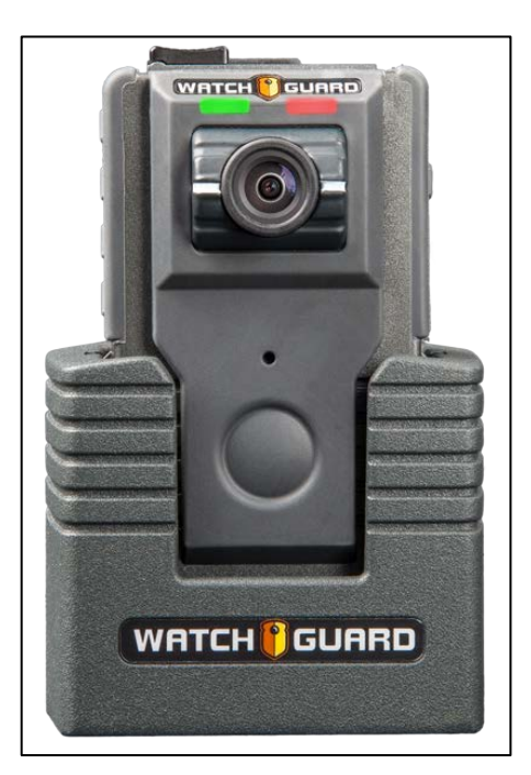
Figure 60. WatchGuard Vista WiFi