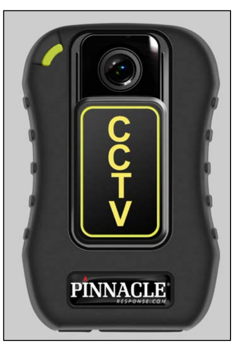
Figure 35. Pinnacle PR5 BWV Camera