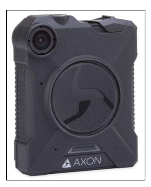
Figure 50. TASER Axon Body 2