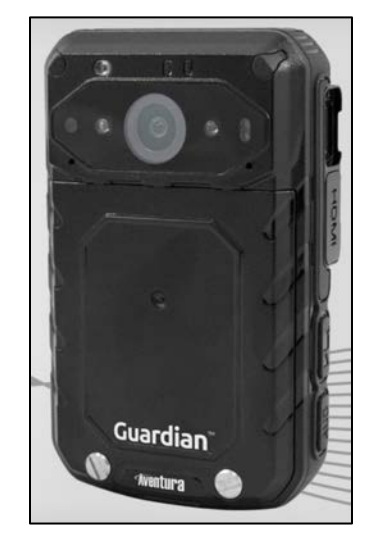
Figure 1. Aventura GPC-RA Body Worn Camera