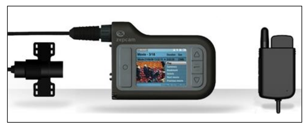
Figure 63. Zepcam TI