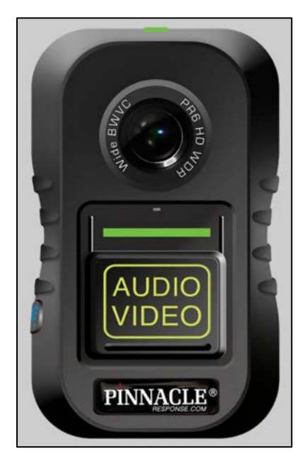
Figure 36. Pinnacle PR6 BWV Camera