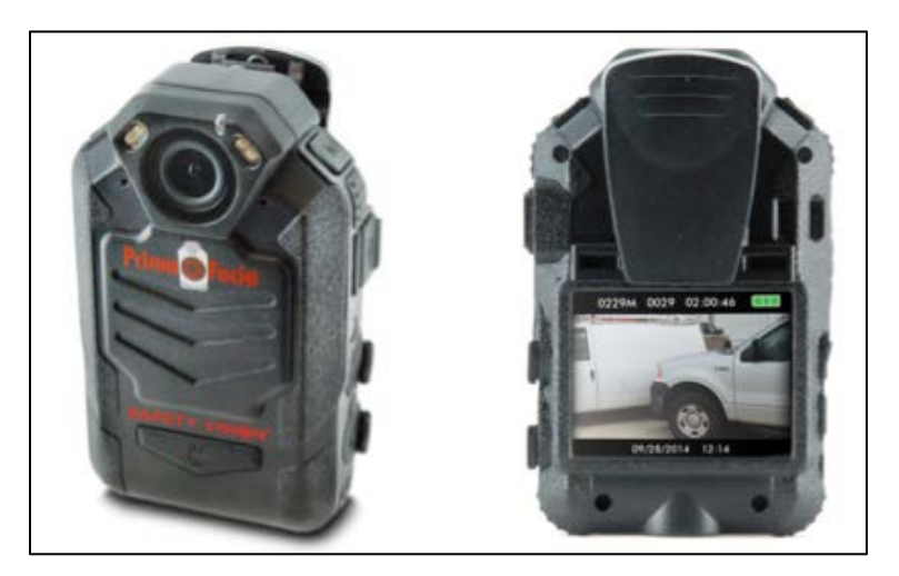
Figure 49. Safety Vision Prima Facie