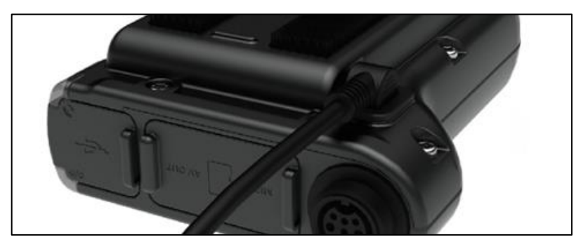
Figure 64. Zepcam TI XT