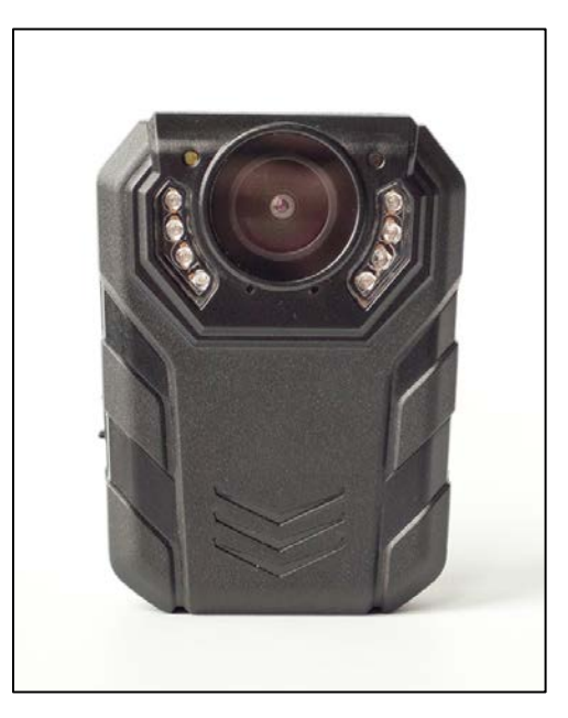
Figure 33. Patrol Eyes SC-DV7