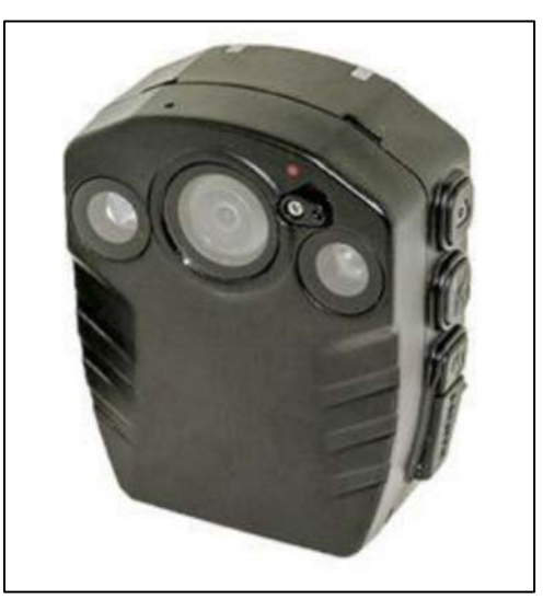
Figure 3. BrickHouse Security HD Waterproof Police Camera