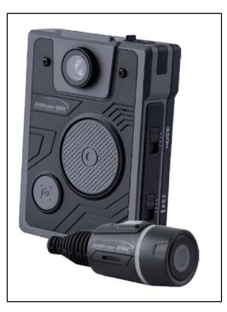
Figure 29. Panasonic Arbitrator