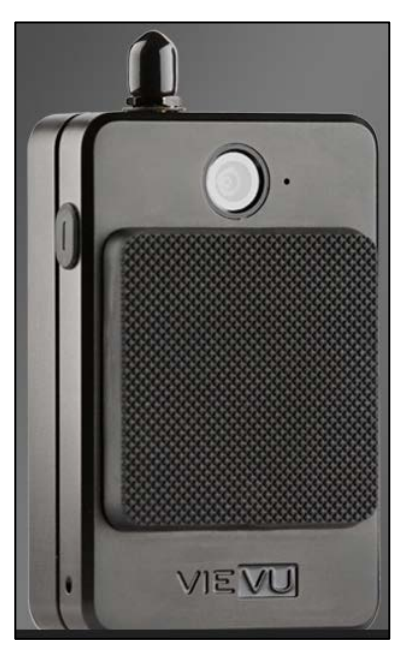
Figure 55. VieVu LE4 Mini