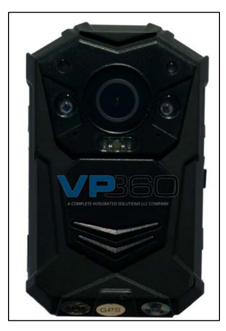
Figure 56. VP360 Argus Gen 1 Digital BWC