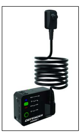
Figure 38. PRG 51 Defender Body Worn Camera