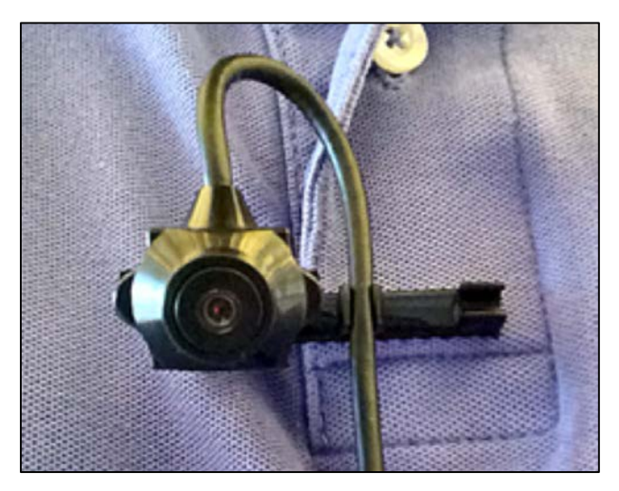
Figure 13. FlyWire Body Worn Security Cam Kit