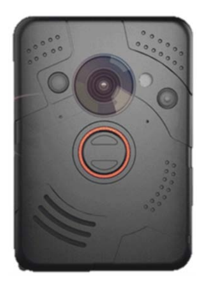
Figure 2. Black Mamba BMPpro Elite