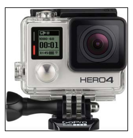
Figure 16. GoPro Hero4 Silver