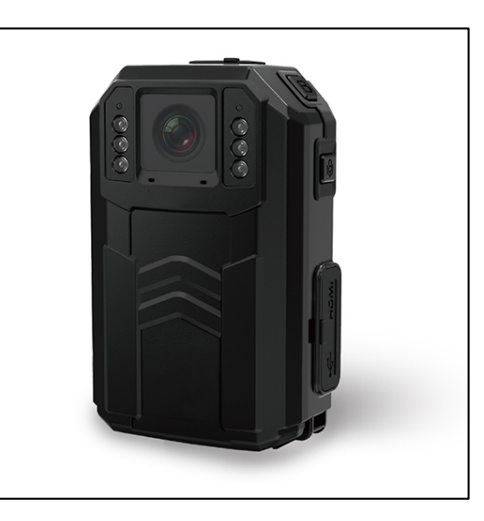
Figure 66. Zetronix HD Blue Line Police Body Camera