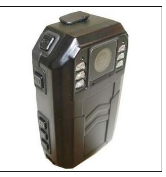
Figure 52. Titan BWC-3HV2