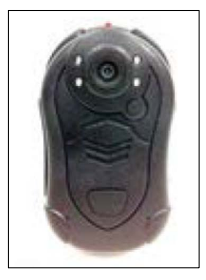
Figure 26. Martel Vid-Shield