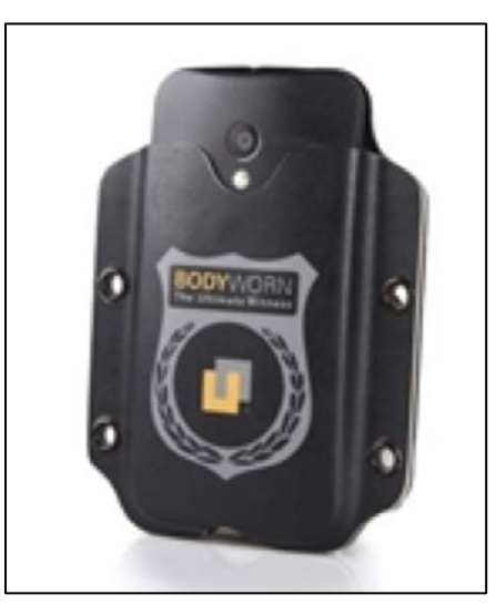
Figure 53. Utility BodyWorn