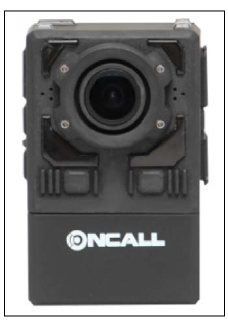
Figure 34. Paul Conway OnCall Camera