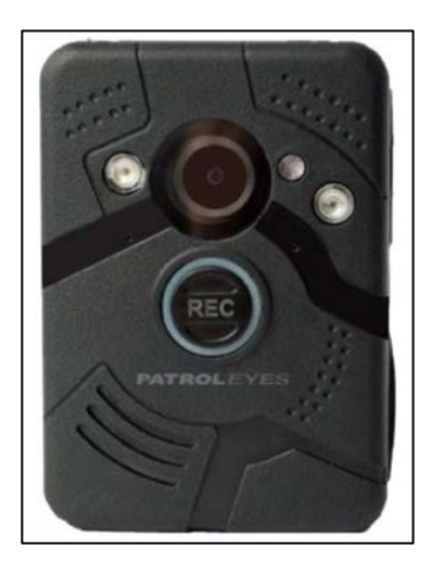
Figure 32. Patrol Eyes SC-DV6