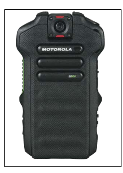
Figure 28. Motorola Si500 Video Speaker Microphone