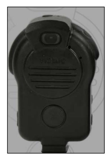
Figure 48. Safety Innovations VidMic VX