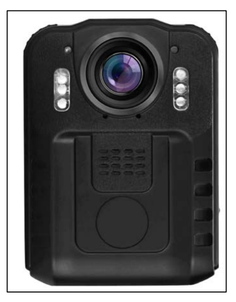
Figure 44. Primal USA DutyVUE PrimeOBSERVER 2020