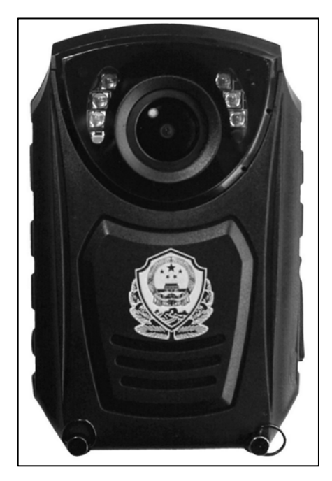
Figure 57. VP360 Argus Gen 2 Digital BWC