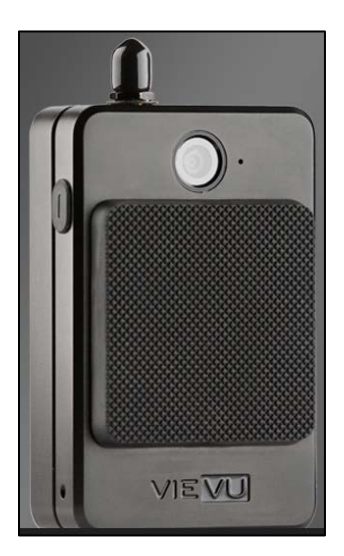
Figure 54. VieVu LE4