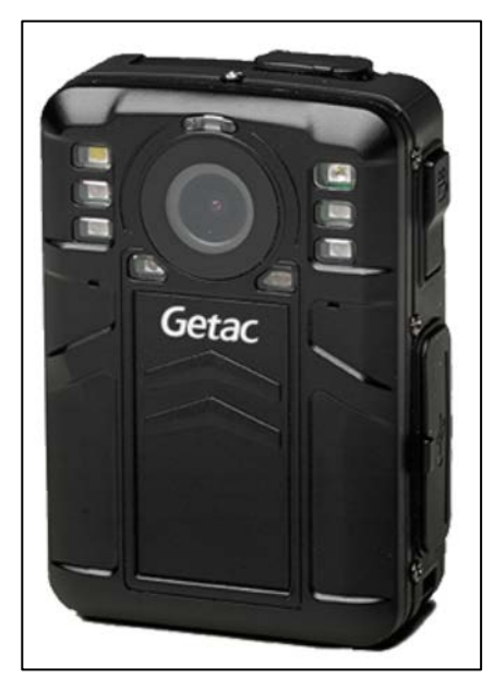
Figure 10. DEI Getac Veretos Body Worn Camera