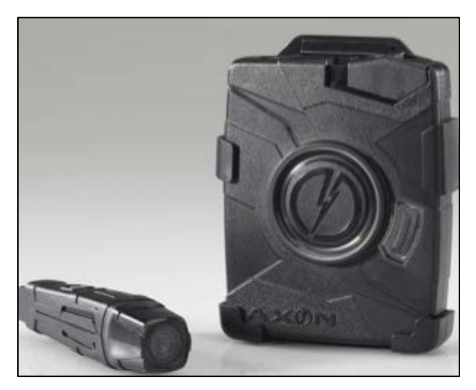
Figure 51. TASER Axon Flex