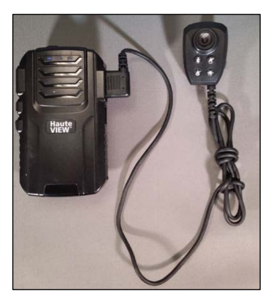
Figure 19. HauteSpot HauteVIEW 200