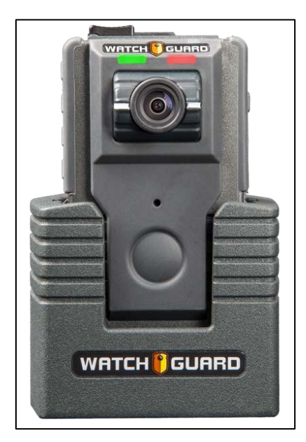
Figure 58. WatchGuard Vista Extended Capacity