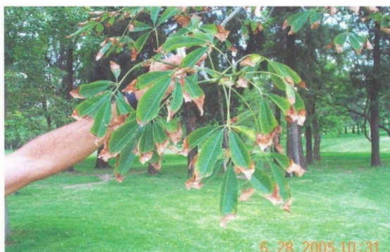
Figure 3. Leaf-tip burn from chloride toxicity.

Problems with chloride toxicity can be diagnosed by leaf firing (a yellow to tan color on leaf tips) that occurs when excess chloride is transported to the growing shoots of plants (See Figure 3). For most users, simply being aware of the chloride concentration in reclaimed water will help diagnose most problems. Consult Table 4 for recommended concentrations and note that foliar damage does not usually occur until the chloride concentration exceeds 100 mg/L (ppm).