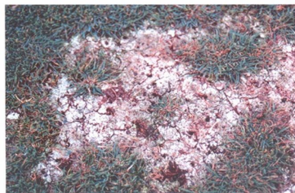
Figure 1. White surface crust on soil with high salt accumulation. Source: Duncan et al. (2009).