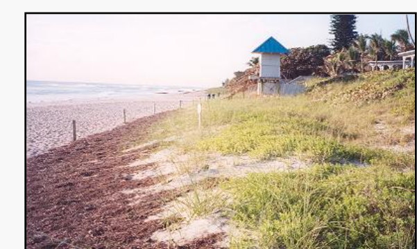
Seaweed is valuable to the dune system as a source of nutrients and a sand stabilizer.

Seaweed is beneficial to the beach and an important component of the ecosystem. The Department of Environmental Resources Management recommends that beach raking be limited to the more heavily used beaches. Beach raking too close to the dune can destroy new seedlings establishing at the leading edge of the dune. Although seedlings in this pioneer zone often become buried by wind-blown or storm-deposited sand, they usually grow through the new sand layer and continue to stabilize the area. Beach rake operators should stay well away from the toe of the dune. Seaweed removed from the beach can be deposited in a thin layer (2-3") at the toe of the dune.