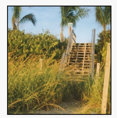
Use dune crossovers when accessing the beach.

Following storm events, the change in beach profile should be noted. Has erosion occurred, or has sand simply been pushed higher on the beach covering previously exposed vegetation? In the case of the latter, recreational activities and cabanas should be kept far enough away from this location to allow the buried vegetation to re-emerge through the sand.