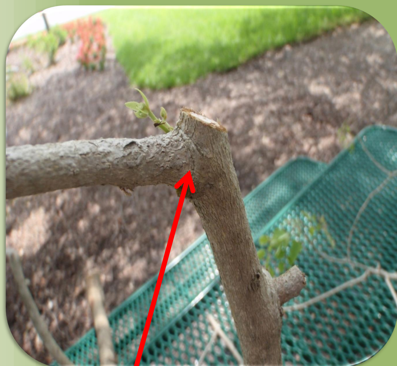
Branch Bark Collar