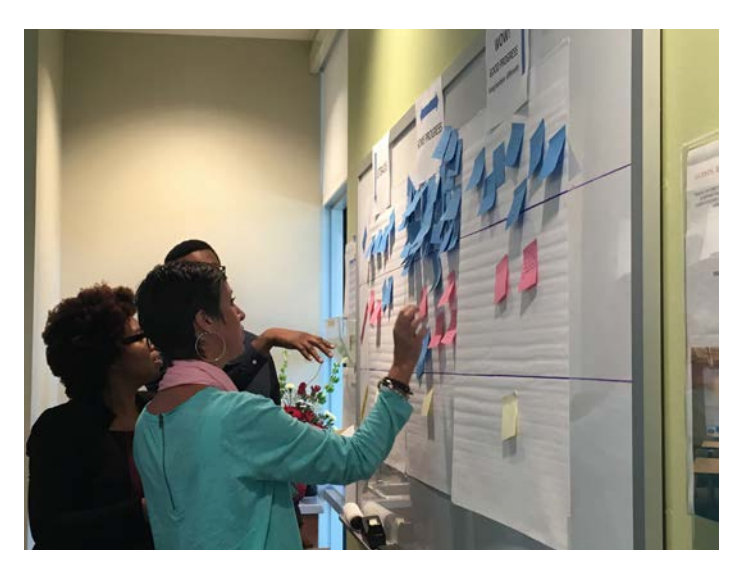
further efforts and impact in the community.

Representatives from various member organizations came together to self-evaluate and review the past year's achievements. Participants also brainstormed methods to