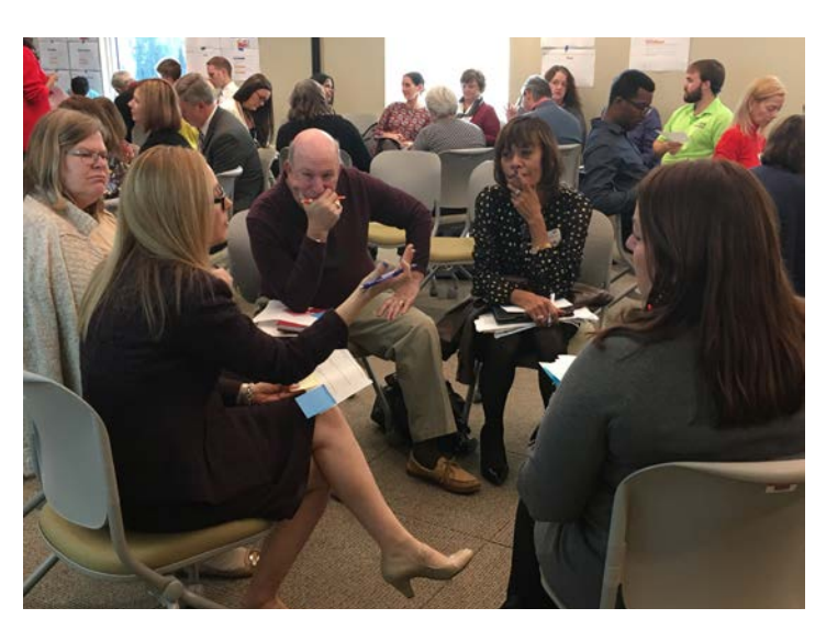
Youth Services participated in the Birth to 22: United for Brighter Futures Task Force Meeting on Dec. 13, 2017, at the Children's Services Council.

Representatives from various member organizations came together to self-evaluate and review the past year's achievements. Participants also brainstormed methods to