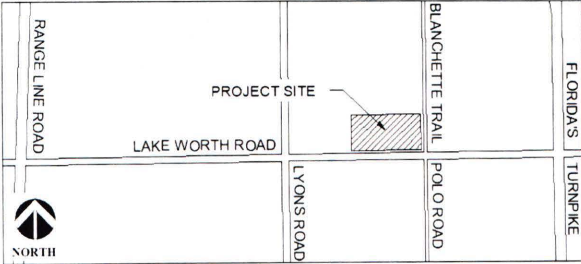
EXHIBIT B VICINITY SKETCH