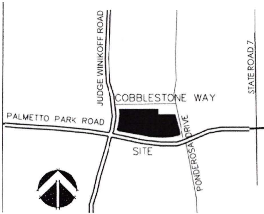
EXHIBIT B VICINITY SKETCH