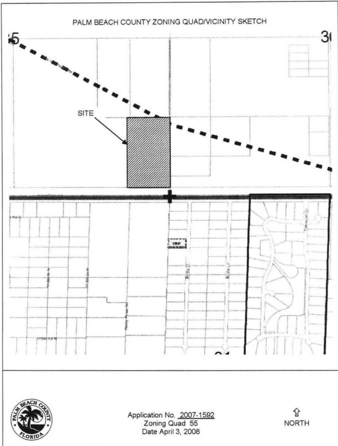
EXHIBIT B VICINITY SKETCH