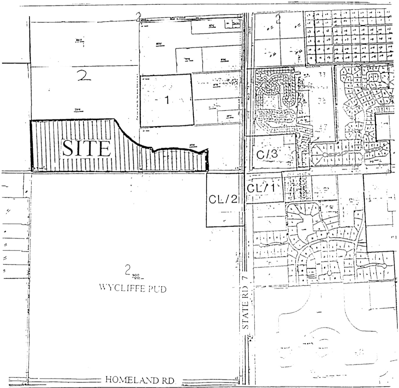
EXHIBIT B VICINITY SKETCH