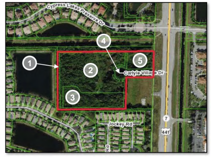
Figure 1: Subject Site, Parcel Designation