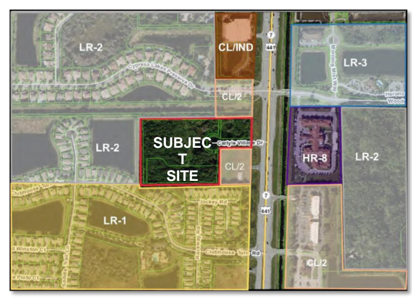
Figure 2: Surrounding FLU Designations

South: Thoroughbred Lake Estates, located in Unincorporated Palm Beach County. The residential development directly south of the subject site consists of 283 single-family units. The property has a LR-1 FLU designation and is within the PUD Zoning District.