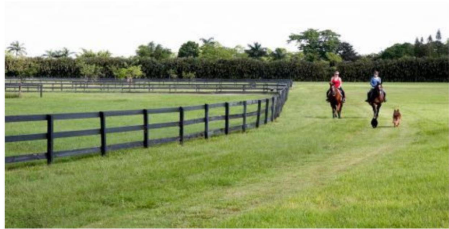
Irish Acres www.irishacresfl.com