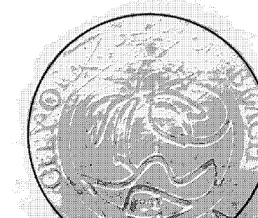
CITY OF WEST PALM BEACH SEAL