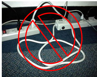
No Daisy Chaining