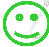
Plugged Directly into an Electrical Outlet