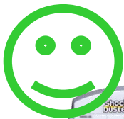
Plugged Directly into an Electrical Outlet

To Schedule your BTR Inspection, please call (561) 531-3521 or send an email to Fire-BTR@pbcgov.org