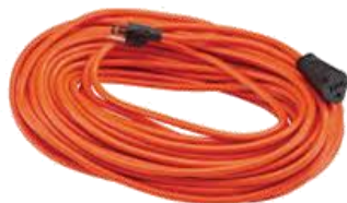
Extension cords are for Temporary Use ONLY and NOT to be used as permanent wiring

For more information on Fire Safety click here