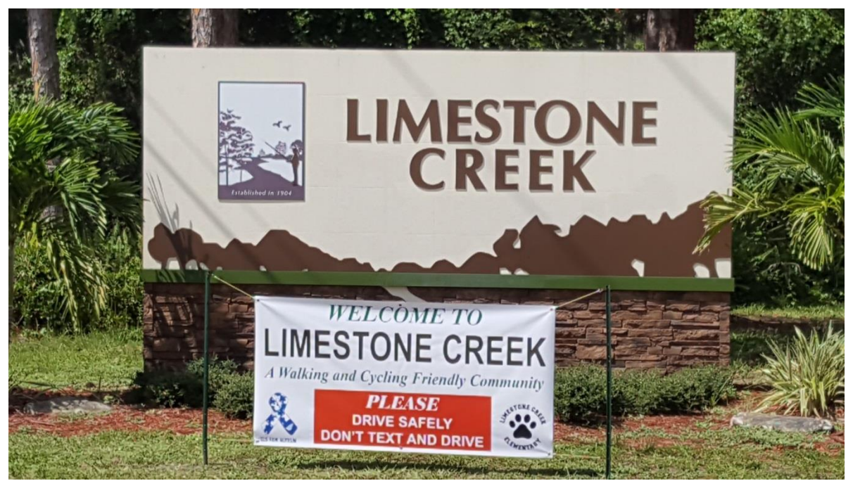
CCRT Neighborhood Limestone Creek Entry Sign