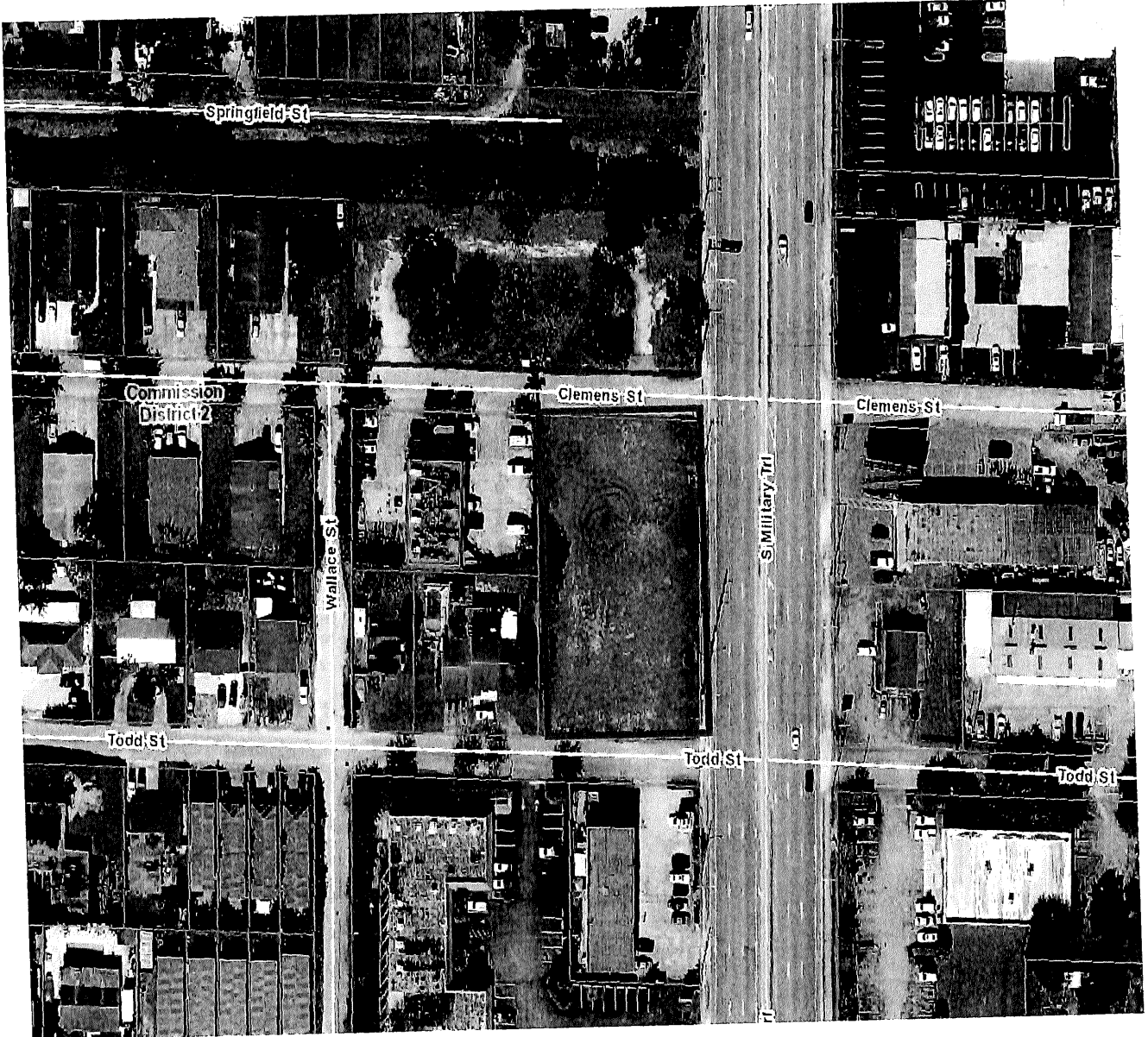
4521 Clemens Street