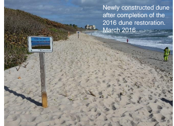
Newly constructed dune after completion of the 2016 dune restoration. March 2016