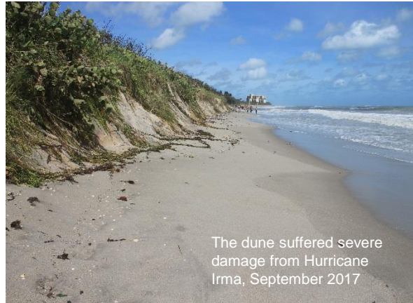
The dune suffered severe damage from Hurricane Irma, September 2017