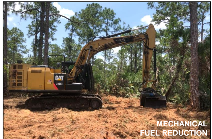
MECHANICAL FUEL REDUCTION

Mechanical Fuel Reduction: ERM has begun work at Royal Palm Beach Pines Natural Area to reduce the risk of wildfire activity and improve the health of the ecosystem by using mechanical equipment to clear vegetation. Less vegetation means that less fuel will be available to a wildfire, should one occur. With less fuel, fires burn at a lower intensity and for a shorter duration, making them more easily controllable. There’s a benefit to the ecosystem as well: clearing overgrown vegetation allows threatened Florida native species such as gopher tortoise, milkweed, rosemary, and pinweed to thrive.