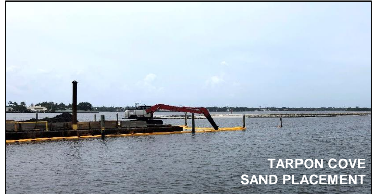
TARPON COVE SAND PLACEMENT

Loxahatchee Slough Grand Opening: The latest public use facilities for the Loxahatchee Slough, Palm Beach County's largest natural area (12,957 acres), have officially been opened. The entrance is located at 11855 Beeline Highway, 1.6 miles north of PGA Blvd in the City of Palm Beach Gardens. A 0.25 mile paved walking trail leads from the parking lot to an observation platform overlooking a wetland. Amenities include an educational kiosk, fishing pier, picnic tables, miles of natural surface hiking trails and an observation tower. The new facilities encourage passive activities like wildlife viewing and photography, which will protect historic native habitats and biological diversity by increasing environmental awareness.