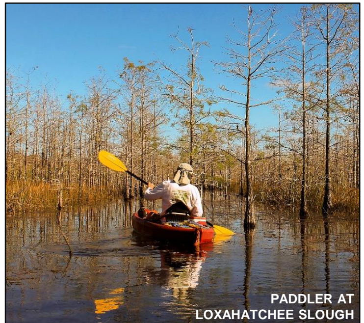
PADDLER AT LOXAHATCHEE SLOUGH

Loxahatchee Slough Grand Opening: The latest public use facilities for the Loxahatchee Slough, Palm Beach County's largest natural area (12,957 acres), have officially been opened. The entrance is located at 11855 Beeline Highway, 1.6 miles north of PGA Blvd in the City of Palm Beach Gardens. A 0.25 mile paved walking trail leads from the parking lot to an observation platform overlooking a wetland. Amenities include an educational kiosk, fishing pier, picnic tables, miles of natural surface hiking trails and an observation tower. The new facilities encourage passive activities like wildlife viewing and photography, which will protect historic native habitats and biological diversity by increasing environmental awareness.