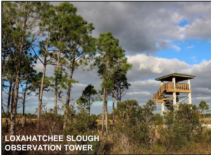
LOXAHATCHEE SLOUGH OBSERVATION TOWER

Tarpon Cove: Placement of sand from the Town of Palm Beach Marina expansion began in late May and is estimated to be 10% complete. This beneficially reused material will fill a dredge hole to create additional islands and seagrass and mangrove habitat.