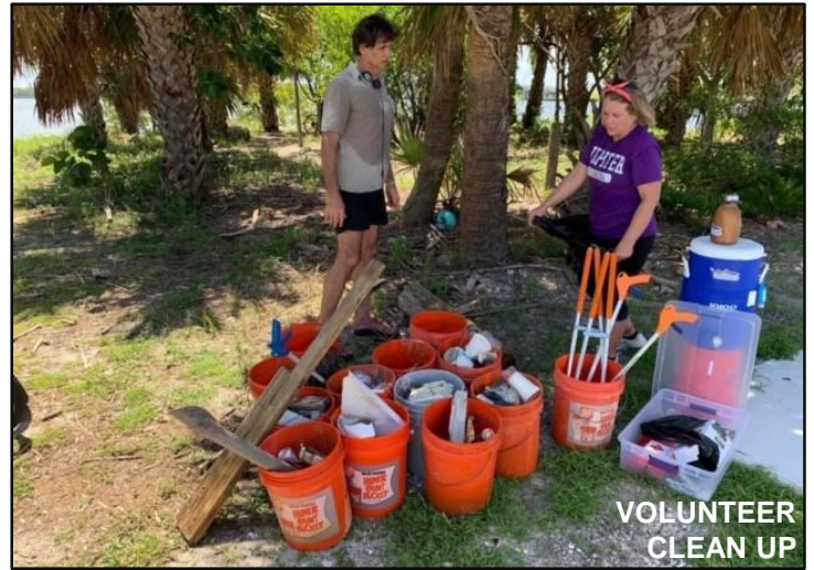
VOLUNTEER CLEAN UP

Lake Worth Lagoon Volunteers: Half a dozen volunteers from the Lake Worth Waterkeeper group put in quite a bit of effort to clean up the shoreline along the Jewell-Steinhardt Cove Living Shoreline. They gathered over 200 lbs. of trash and debris, including a heavy piece of wood piling, and dismantled a makeshift shelter that had been built near the beach.