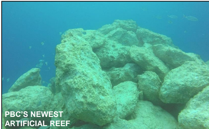
PBC'S NEWEST ARTIFICIAL REEF

Artificial Reef Deployment: The County deployed 645 tons of limestone boulders 1 mile south of the Lake Worth Inlet in 40 ft. of water. The boulders were placed near an existing reef comprised of reused concrete and mermaid statues. Each pile consists of 323 tons of limestone with approximately 10ft. of relief. The material and deployment was funded in part by a Florida Fish and Wildlife Conservation Commission (FWC) Artificial Reef Grant. These reefs provide great fish habitat and easy access for shallow-water dives.