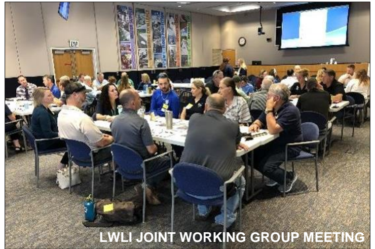
LWLI JOINT WORKING GROUP MEETING

Representatives from over 20 organizations comprised of state agencies, local municipalities, non-profit groups, private companies and county residents, provided feedback which included, expanding educational campaigns on reducing stormwater impacts throughout the lagoon's watershed; and increasing the lagoon's resilience and sustainability by promoting the implementation of living shorelines, green infrastructure and low impact development.