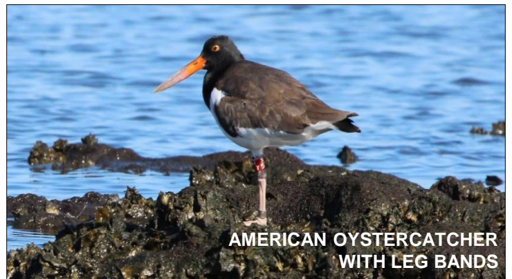
AMERICAN OYSTERCATCHER WITH LEG BANDS