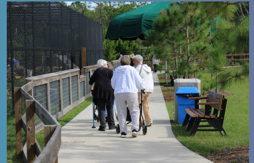
NCSC seniors visiting Busch Wildlife Sanctuary