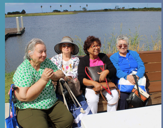
West County Senior Day 2024

Description: Come join in on the fun! The day will feature a variety of fun activities and games, vendors, and a picnic in the park!