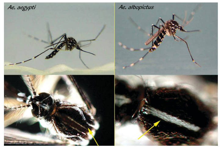
Figure 1. Aedes aegypti (left) and Aedes albopictus (right)

Ae. albopictus is characterized by its small, black and white body. It also has black and white striped legs but instead of a lyre pattern, it has a single silvery white scale stripe along the dorsal side of the thorax (Figure 1). The original range of this species was throughout the oriental region from the tropics of Southeast Asia, the Pacific and Indian Ocean islands, north through China and Japan and west to Madagascar. During the 19th century, its range expanded to include the Hawaiian Islands. It was introduced into Texas in 1985 and since then has expanded to include close to 30 states in the United States and 866 countries worldwide (CDC 2007). It is found throughout Florida with the possible exception of the Florida Keys. In many places, the arrival of Ae. albopictus has been associated with the decline in the abundance and distribution of Ae. aegypti (O'Meara et al. 1995). Ae. albopictus occurs in the same types of habitats as Ae. aegypti, however, it occurs in non-urban locations more frequently than Ae. aegypti, and in general, tends to prefer less urbanized areas than the former species (Rev et al. 2006).