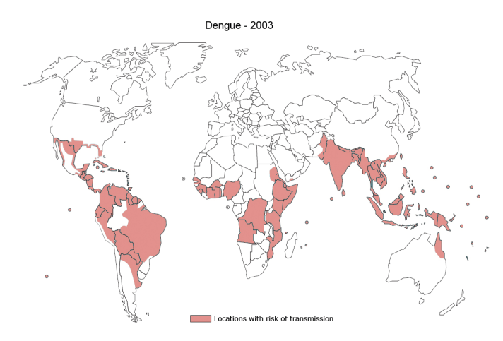
Figure 3. Areas at risk of dengue transmission.

More than 2.5 billion persons now live in areas at risk of infection (Figure 3), and attack rates for reported disease during epidemics can be in the range of 1 per thousand to 1 per hundred of the population.