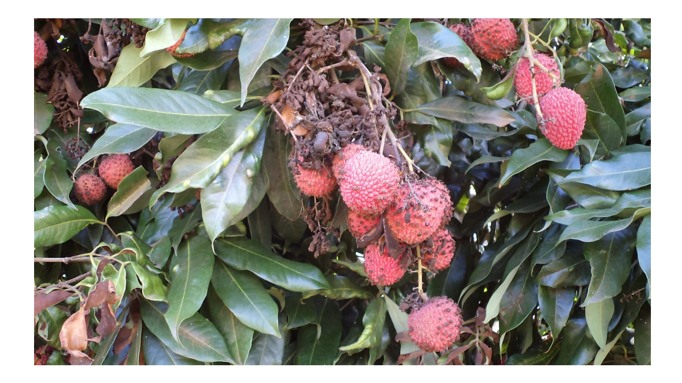
Figure 4. LEM also feeds upon fruit. Consequently, erinea may also develop on fruit.