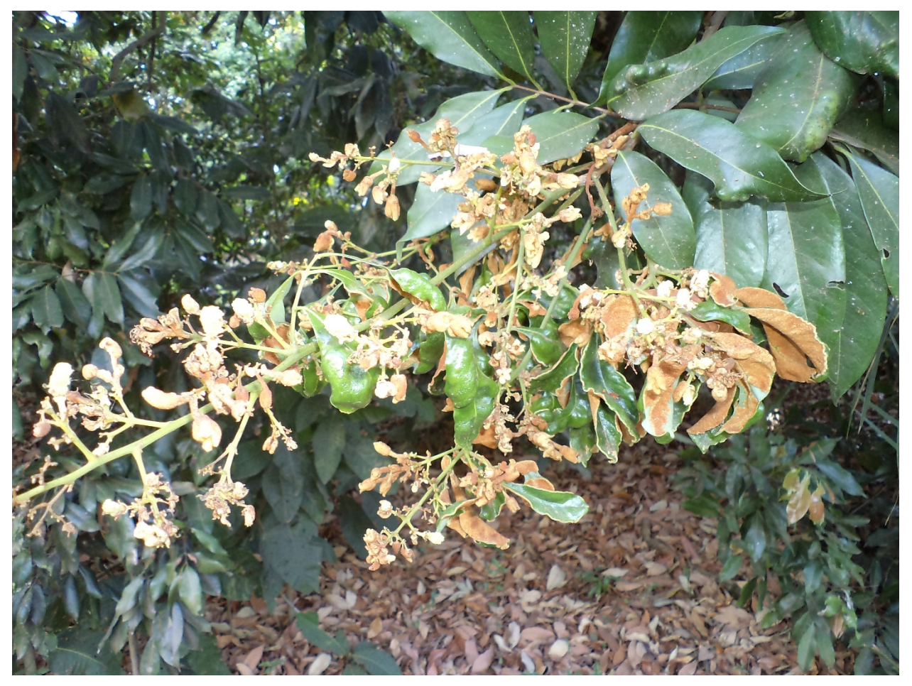
Figure 3. LEM also feeds upon petioles, stems, panicles and flower buds.