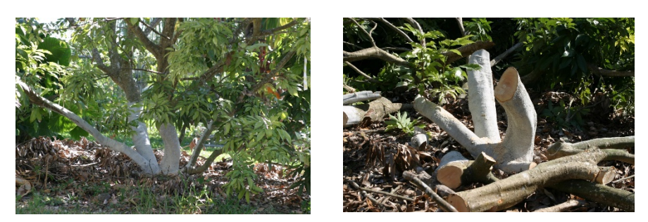
Fig. 1. Trunk and major limbs whitewashed to height of pruning.

water) should be made to all limbs and trunks from the height at which trees will be cut to the ground. This will protect them from sunburn when exposed to full sun.