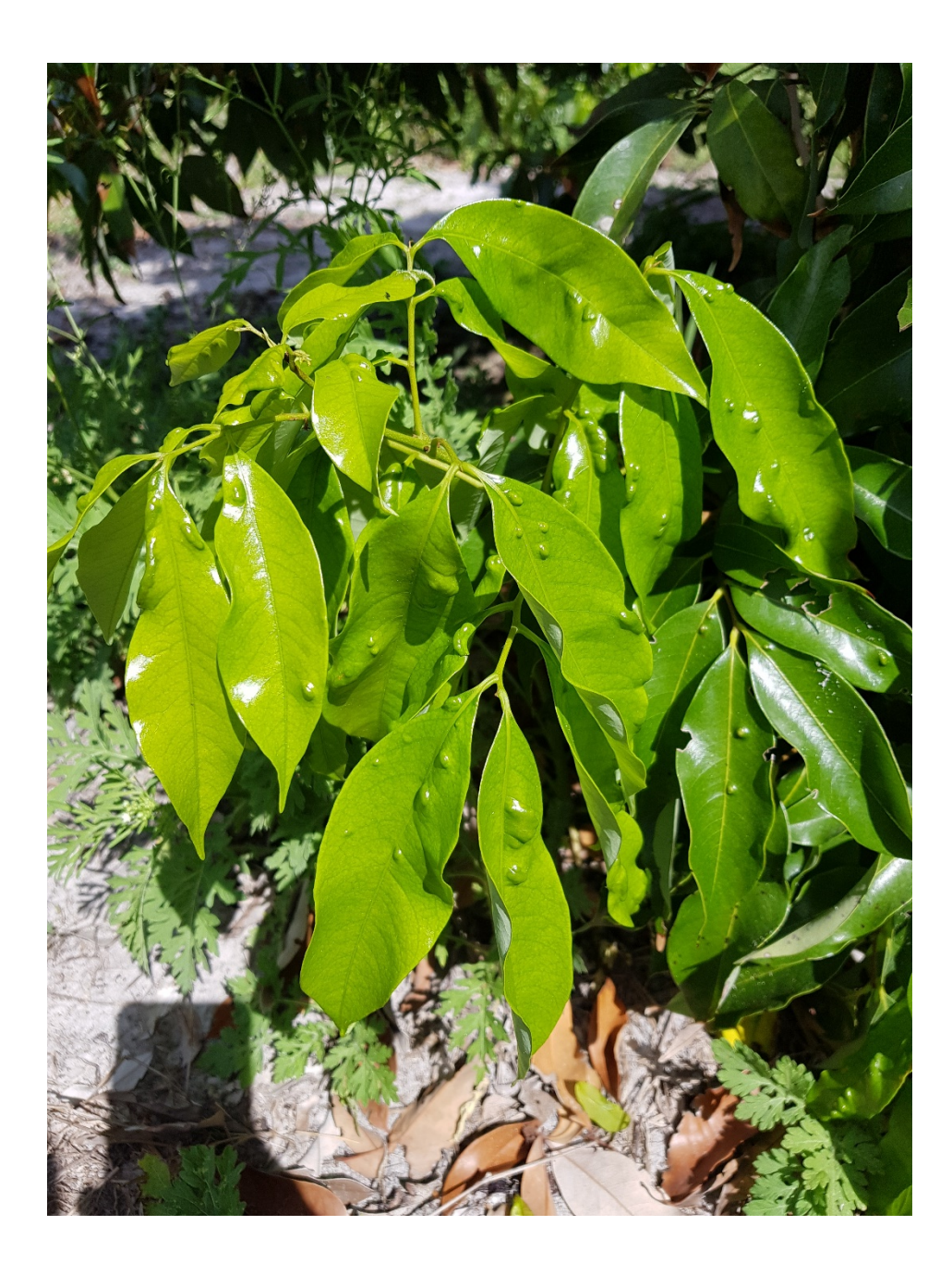
Figure 1. LEM infests immature lychee leaves and forms small blisters.