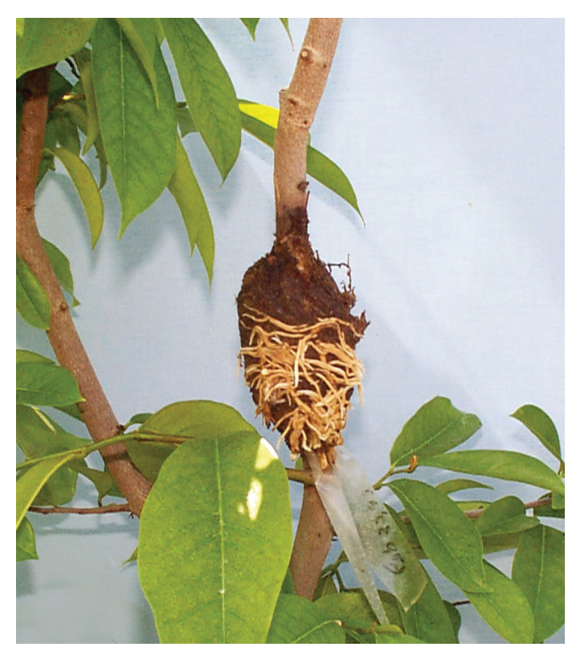
Figure 8. Air layering on a lychee tree.