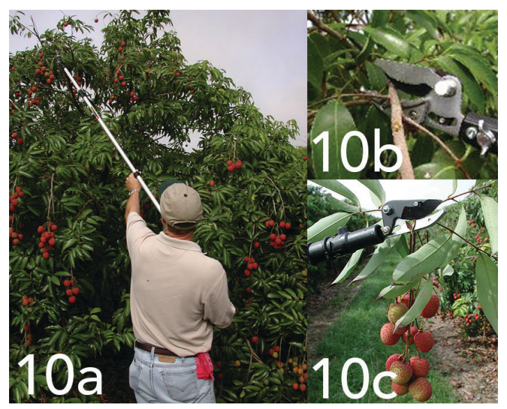
Figure 9. 10a) Harvest pole aid; 10b) Close-up of harvest aid with cutting edge and clamp; and 10c) Close-up of harvest pole aid and clipped fruit.

Fruit are harvested by cutting the main stem bearing the fruit clusters several inches behind the fruit clusters (Figure 9). Fruit may or may not be detached from the fruit clusters before storage. Ripe fruit are sweet, plump, and of the size and color characteristic of the cultivar (Table 1). Fruit picked while immature are not sweet and have poor flavor.