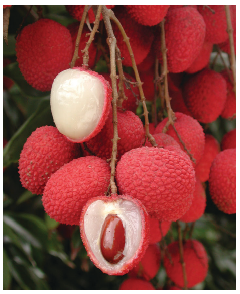
Figure 5. Lychee Fruit. 'Brewster' lychee fruit.

The fruit is a drupe and fruit are borne in loose clusters numbering from 3 to 50 fruits and are round to oval and 1.0 to 1.5 inches (25 to 38 mm) in diameter (Figures 1 and 5). The skin (pericarp) ranges from yellow to pinkish or red and is leathery, with small, short, conical or rounded protuberances. The edible portion of the fruit (pulp) is called an aril that is succulent, whitish, translucent, with excellent subacid flavor. Fruits contain one shiny, dark brown seed, usually relatively large, but it may be small and shriveled (called chicken tongues) in some varieties. Fruit must be ripened on the tree for best flavor.