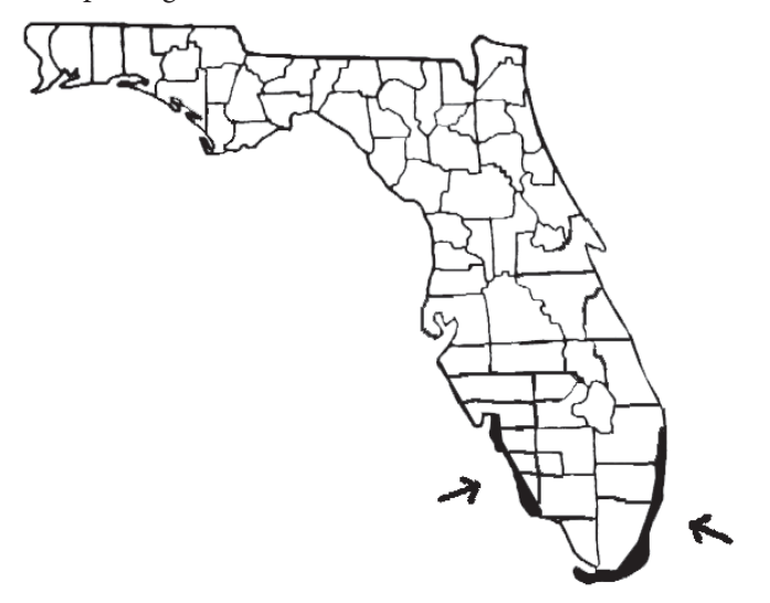
Figure 7. Florida map with dark areas along coast and arrows indicating where lychee may be grown. Credits: Ian Maguire, UF/IFAS

The lychee has more cold tolerance than mango but less than sweet orange, so plantings are limited to coastal areas in southern Florida (Figure 7). Young trees are damaged at temperatures of 28° to 32°F (-2° to 0°C), while temperatures down to 24° to 25°F (-3° to -4°C) cause extensive damage or death to large trees if exposed for several hours. Lychee trees do not acclimate to cold temperatures after exposure to cool, nonfreezing temperatures. Symptoms of cold damage include leaf death, leaf drop, stem and limb dieback, bark splitting, and tree death.