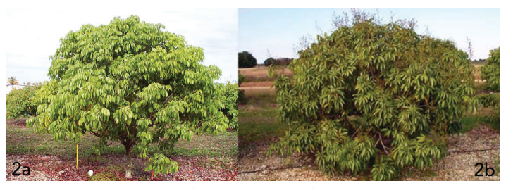
Figure 2. 2a) Lychee tree; 2b) Lychee tree in bloom.