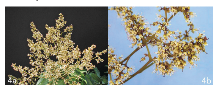
Figure 4. 4a) Lychee inflorescence in full bloom; 4b) Lychee inflorescence in full bloom.

Flowers are small, greenish, and are borne on a large thyrse (a many-flowered inflorescence) that emerges at the ends of branches anytime from late December to April (more commonly February and March) in Florida (Figures 4a and 4b). There are three flower types: two male types (called M1 and M2) and one female (called F). In general, the M1 flowers open first, female flowers (F) open second, and M2 flowers open third.