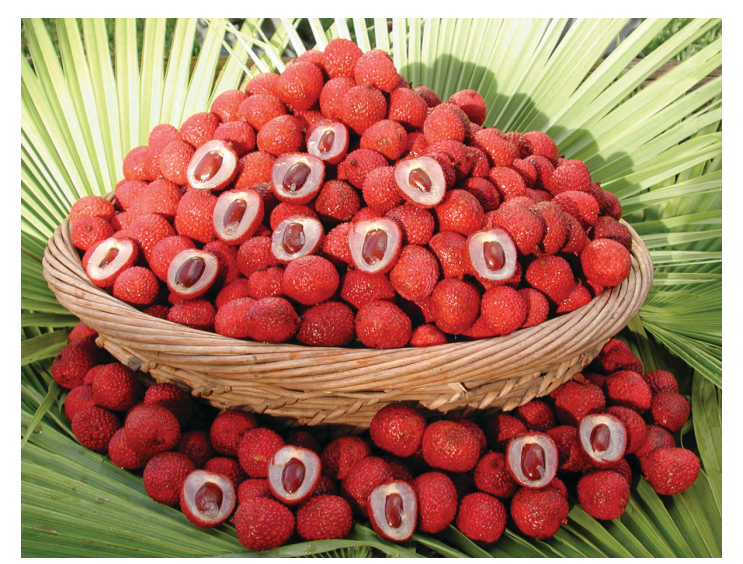
Figure 1. 'Brewster' lychee fruit.

Production: Lychee are grown commercially in many subtropical areas such as Australia, Brazil, southeast China, India, Indonesia, Israel, Madagascar, Malaysia, Mauritius, Mexico, Mynamar, Pakistan, South Africa, Taiwan, Thailand, Vietnam, and the US (Florida, Hawaii, and California).