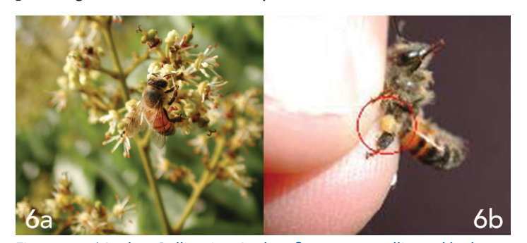
Figure 6. 6a) Lychee Pollination. Lychee flowers are pollinated by bees and wind; 6b) Close-up of honey bee with pollen.

Lychee flowers are pollinated by bees and various fly species (Figure 6). Isolated or single lychee trees will usually set acceptable amounts of fruit. However, recent research has demonstrated that under some conditions, crosspollination among different cultivars may increase fruit set. Therefore, in some cases there may be an advantage to planting more than one variety.