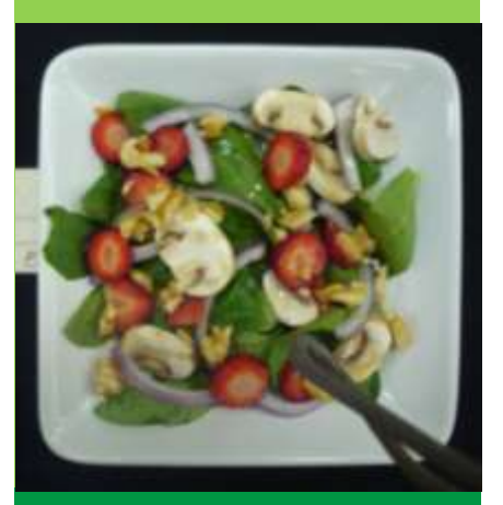
Mouthwatering fresh salad with spinach greens, onions, mushrooms, strawberries, and walnuts

Thirty five youth prepared sixty seven mouth watering dishes while demonstrating their culinary knowledge and skills to expert judges.