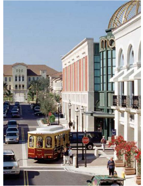
City Place, West Palm Beach.