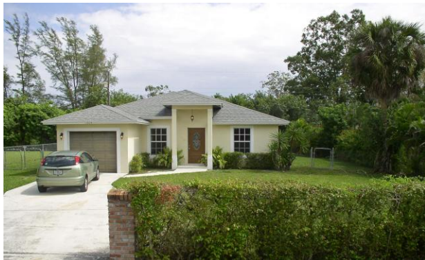
Neighborhood Renaissance rehabilitated this single-family home on Breezy Lane in unincorporated West Palm Beach.