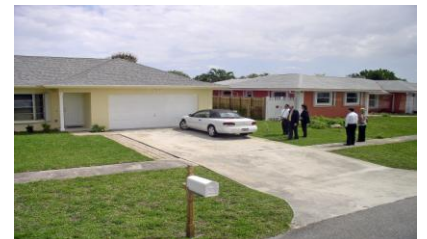
Single-family homes in the Woodcrest community in unincorporated West Palm Beach