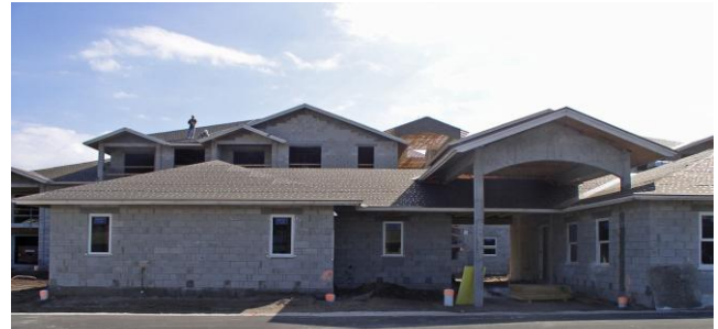
Above : Davis Landings , a 25-unit affordable rental development in unincorporated Lake Worth. The complex is being developed in partnership with the Community Land Trust of Palm Beach County.