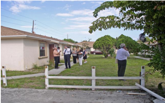
This is a "before" photo of a Neighborhood Renaissance project which will include completely renovating a 9-unit, multi-family complex on Mathis Street in unincorporated Lake Worth.