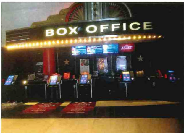
Stage & Screen Quarterly June 2024