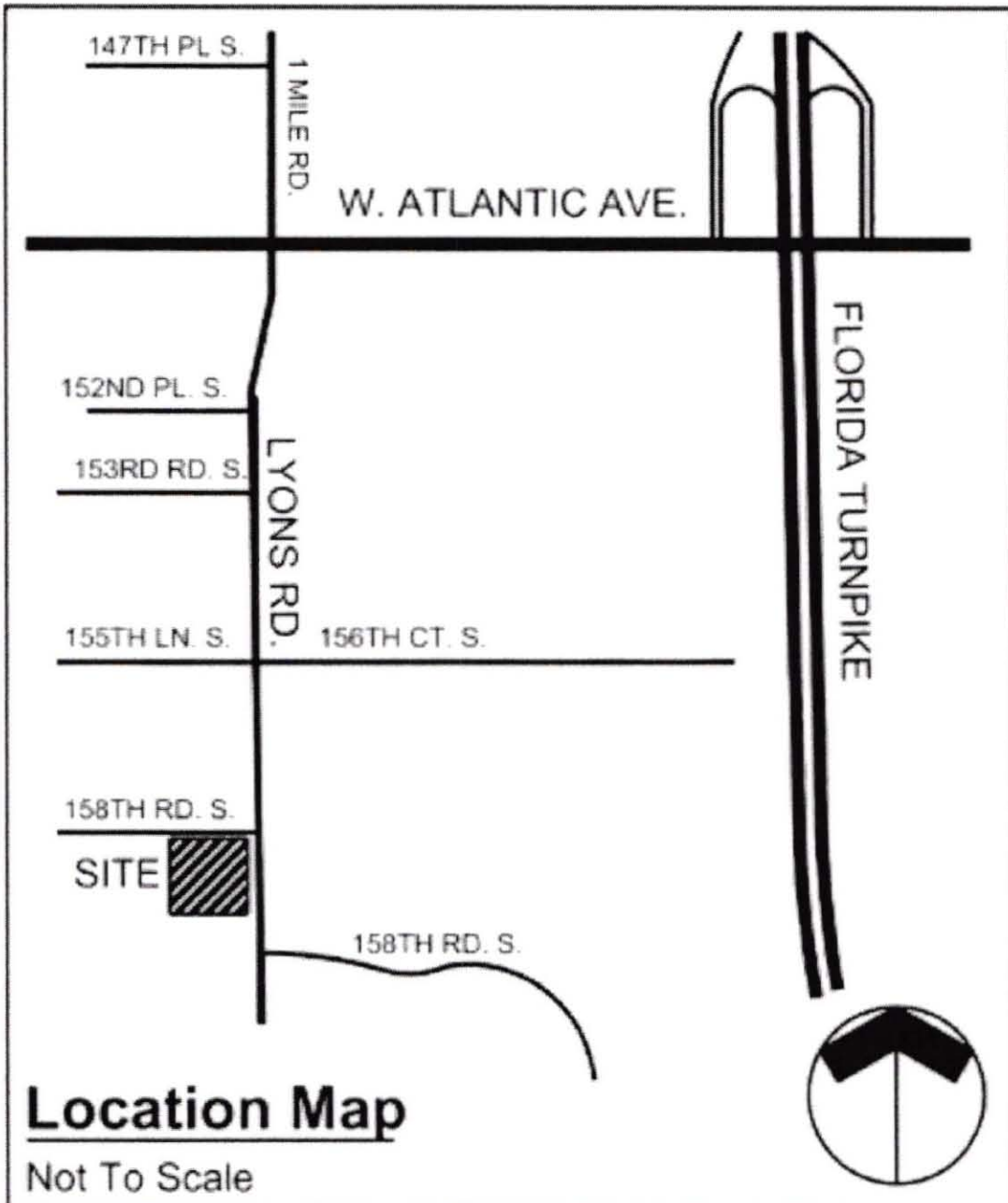
EXHIBIT B VICINITY SKETCH