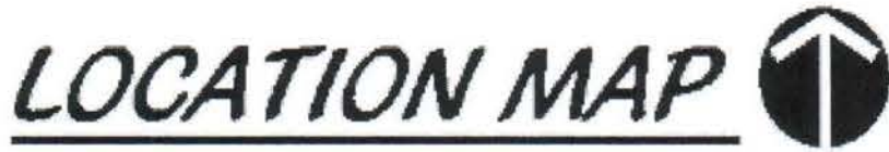
EXHIBIT B VICINITY SKETCH