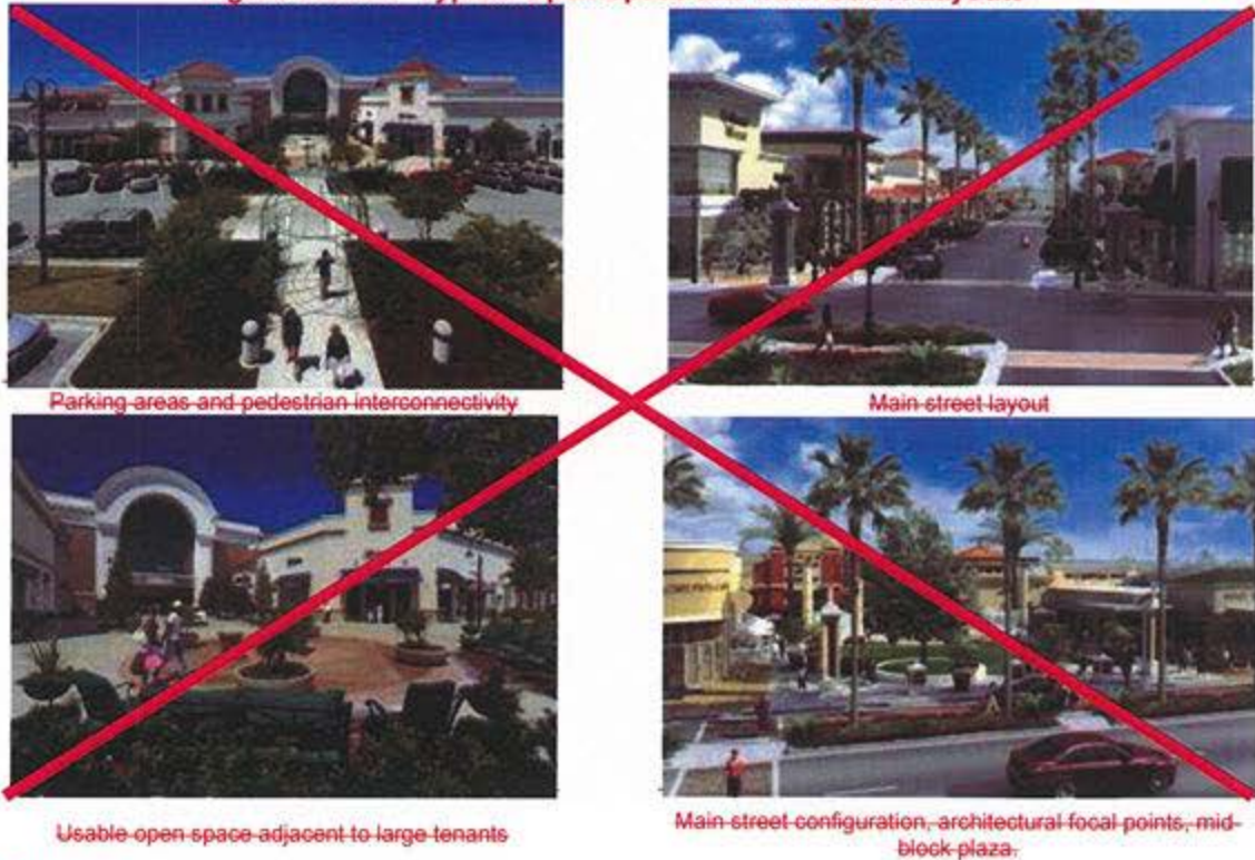
Figure 3.E.8.B – Typical Open Space and Main Street Layouts