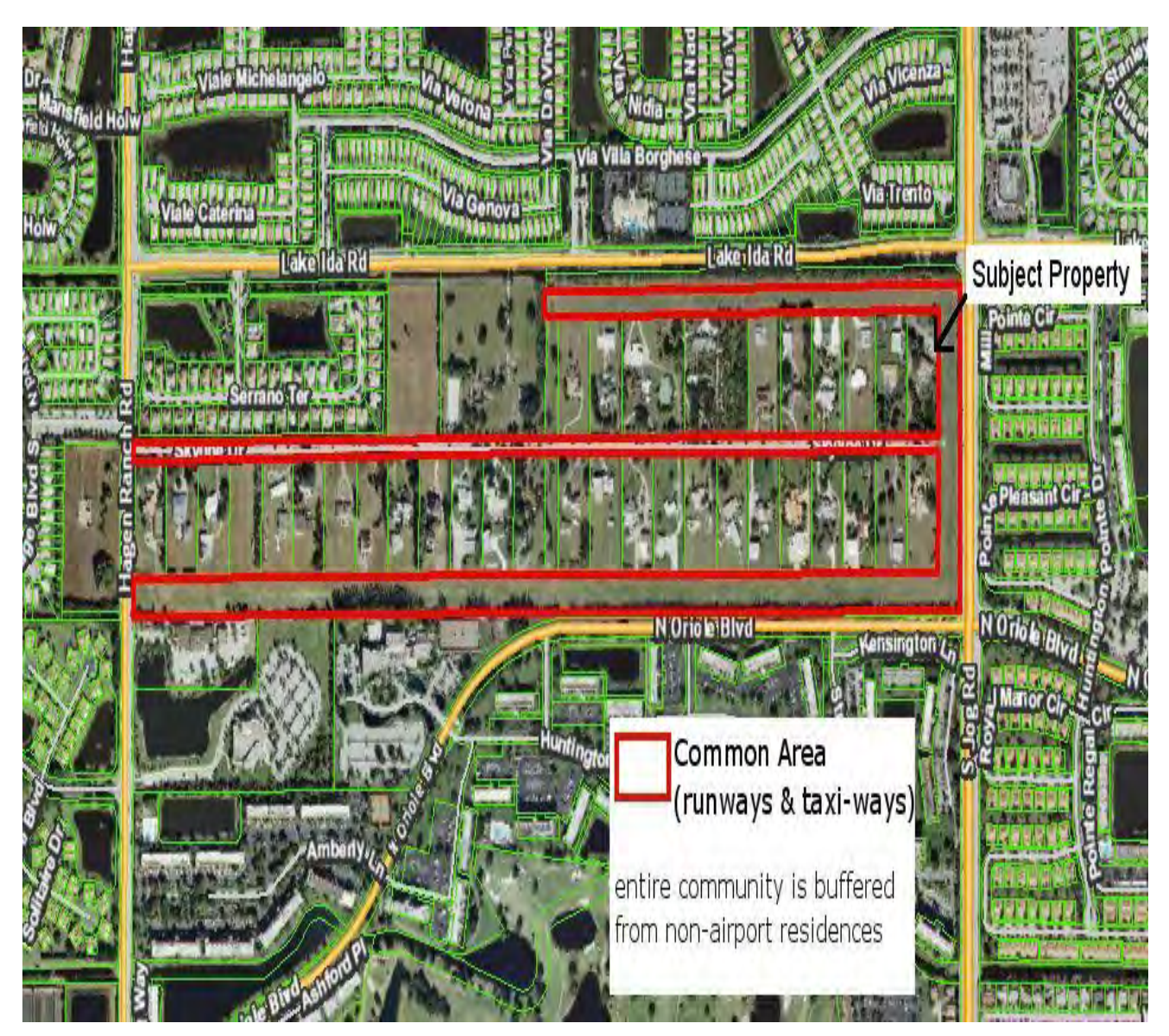
Figure 1 Aerial_HangarSizes West Of Subject