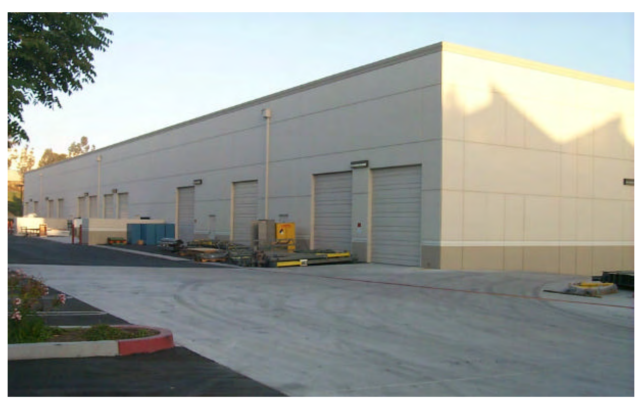
This is the signature building at the top of the street. From the front it looks like a first class office building however from the back you can see the grade and dock high doors. This building is in excess of 24' clear has second story office and is a Class A+ structure.