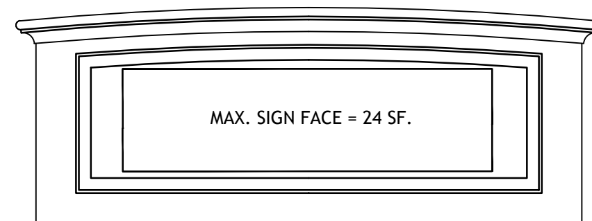
Project Identification Sign - Property corners

NOTE: PER ULDC TABLE 8.G.3.E.-14 IF A DECORATIVE BACKGROUND ELEMENT SUCH AS TILE, STUCCO OR OTHER BUILDING MATERIAL OR COLOR IS USED, THE MAXIMUM SIGN FACE AREA FOR SUCH DECORATIVE TREATMENT MAY BE EXPANDED 24 INCHES, MEASURED FROM THE SIGN FACE AREA IN EACH CARDINAL DIRECTION.