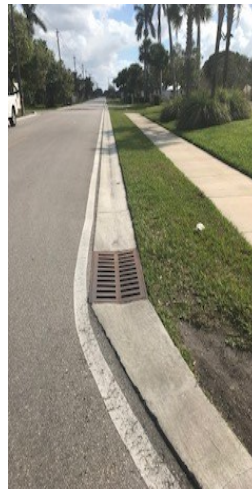
NE Avenue H Drainage