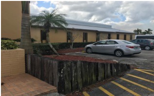
City Hall Retrofit

Here are photos from four of the five former PPL projects from Belle Glade: