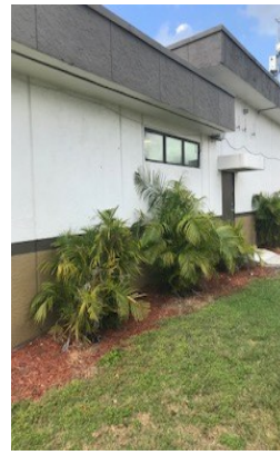
Lake Shore Civic Center Retrofit