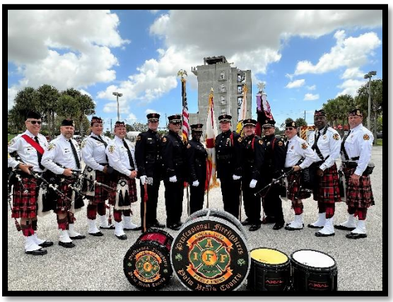
Appreciation luncheon for PBCFR retirees . April 21

Opening Presentation of Colors for Chamber of Commerce of the Palm Beaches Firefighter Appreciation Breakfast. Palm Beach County Convention Center.