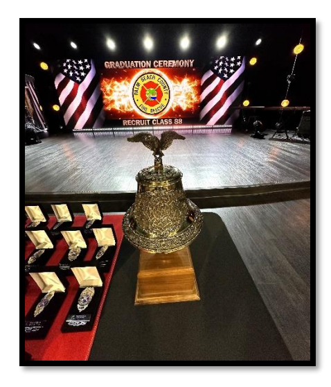
Recruit Class 88 July 7

The Honor Guard performs the opening presentation of the Colors for Palm Beach County Fire Rescue graduations and promotional ceremonies in a show of support and appreciation of the accomplishments of our personnel. We also have a traditional tolling-of-the-bell detail at the conclusion, which ceremoniously acknowledges their graduation or promotion.