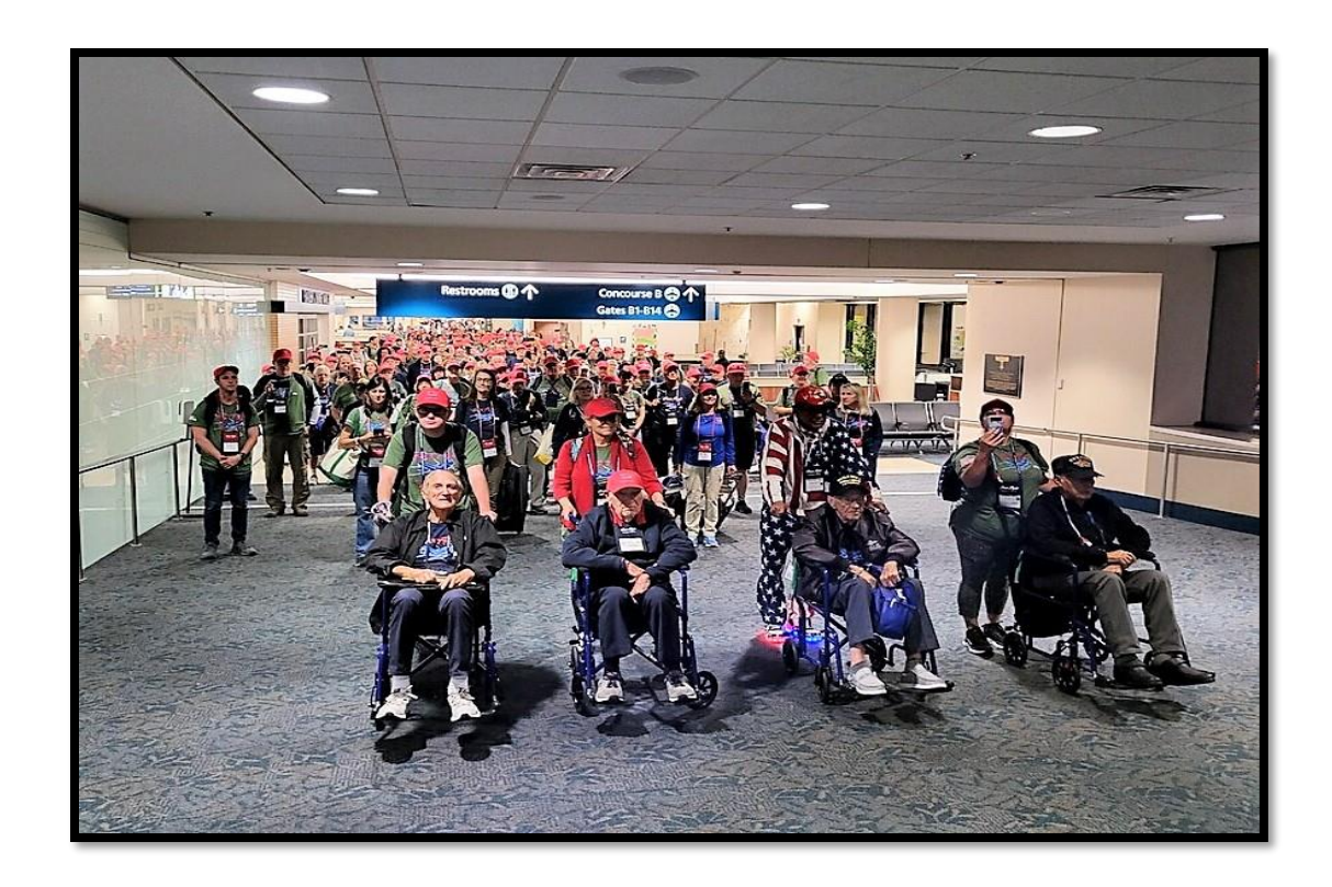
Honor Flight April 15 PBIA

Honor Flights take place four (4) times each year.