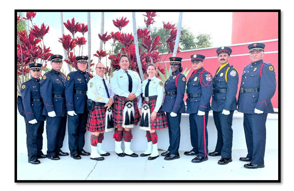
PBSC Academy 128 April 27

We are often asked to provide Honor Guard services for Palm Beach State College Fire Academy graduations. These are typically a multi-agency Honor Guard, since they are not PBCFR-specific.