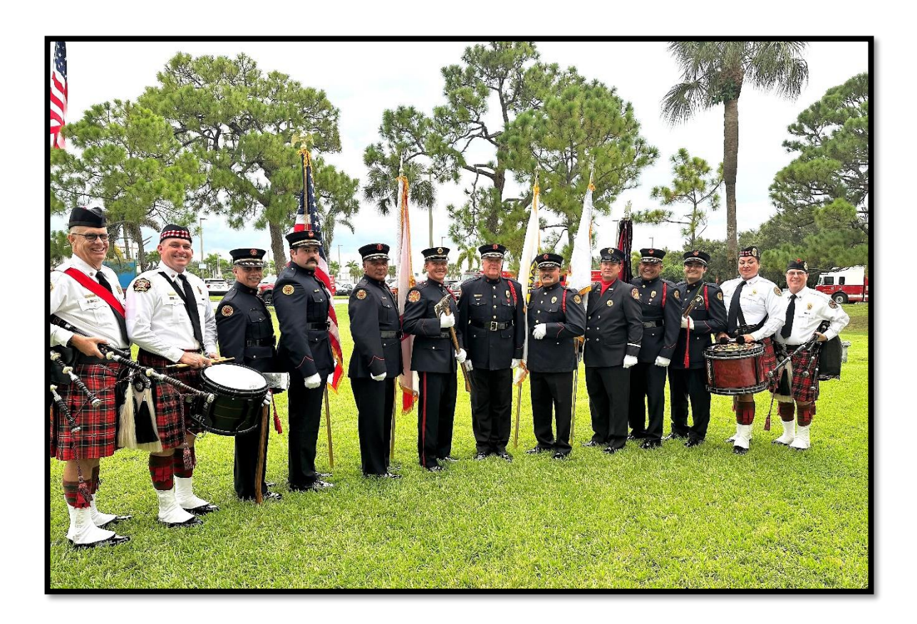
Honor Guard Team Competition

On August 3<sup>rd</sup>, firefighters from Palm Beach County Fire Rescue and Palm Beach Gardens Fire Rescue graduated from the Palm Beach State College Reserve Police Academy . Firefighters wishing to be SWAT medics must be dual certified as police officers and firefighters.