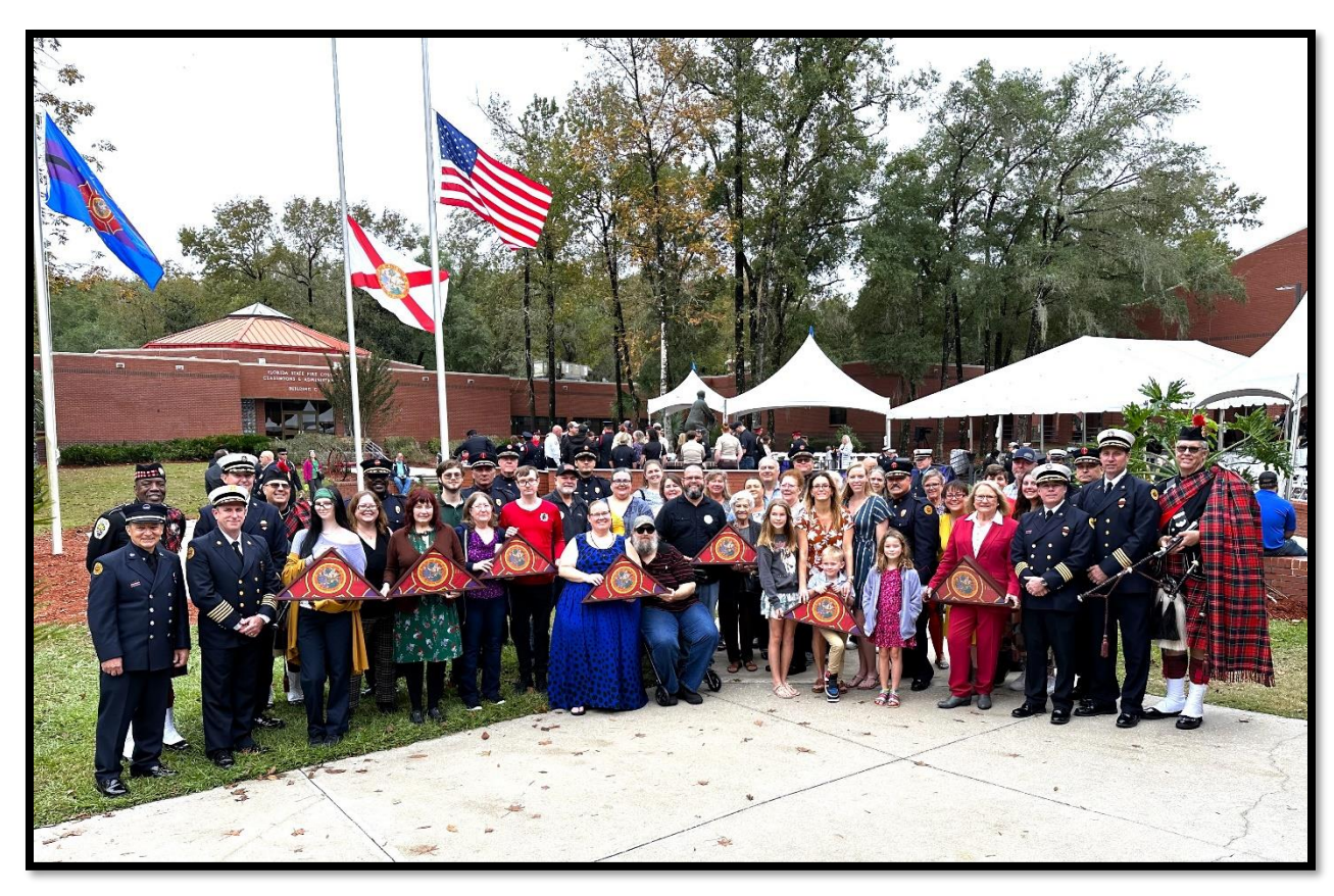
Florida Fallen Firefighter Memorial, Ocala, November 17, 2023

Family members of all seven PBCFR firefighters that were memorialized, attended the ceremony. A total of sixteen firefighters from Florida had their names added to the Memorial for 2023.