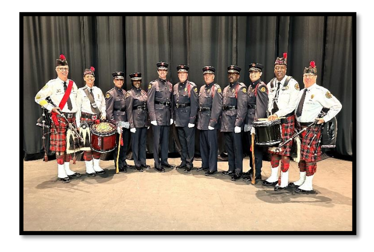
Recruit Class 89 November 14