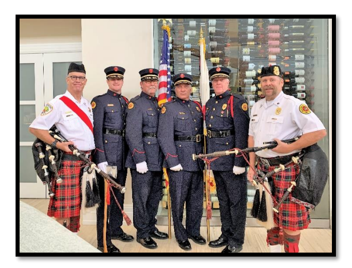
Veterans Appreciation Luncheon Organized by Ibis Country Club April 17

Village of Wellington Veteran's Day Parade and Ceremony November 11