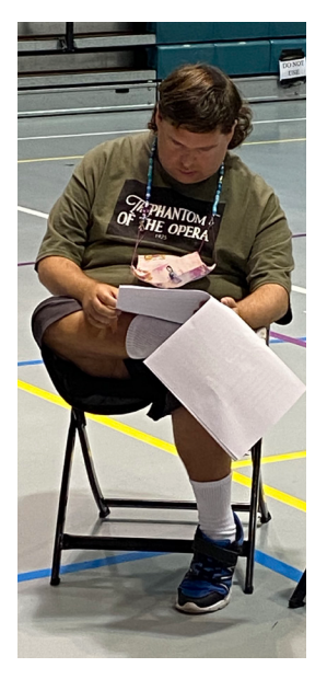
The Community Theatre class at their first table read.