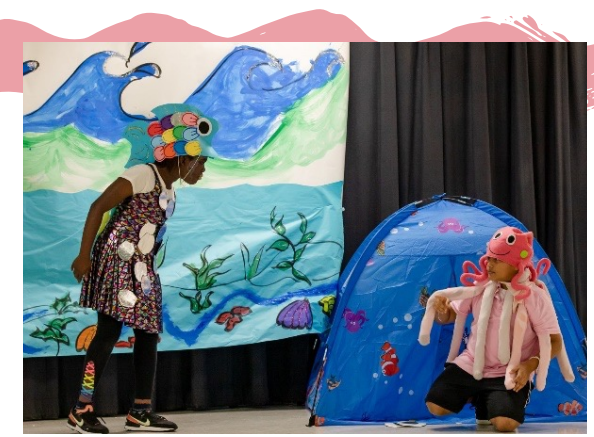
Rainbow Fish talking to the Octopus.