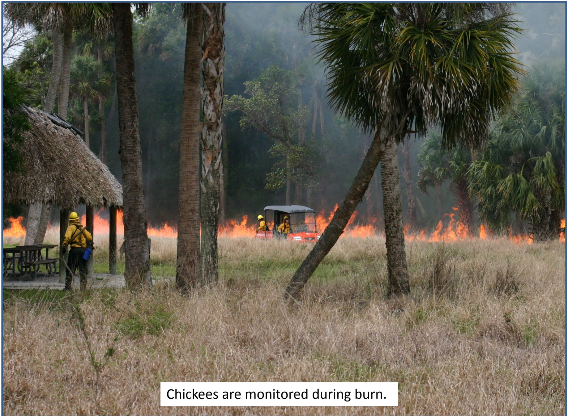
Chickees are monitored during burn.