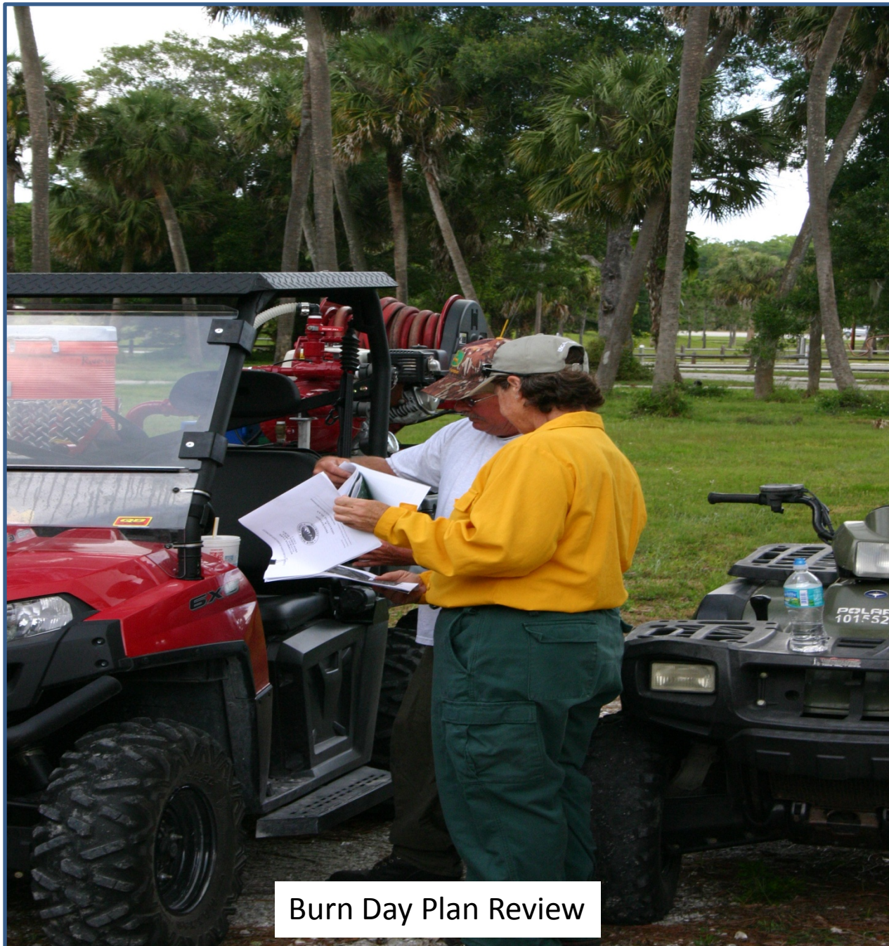
Burn Day Plan Review