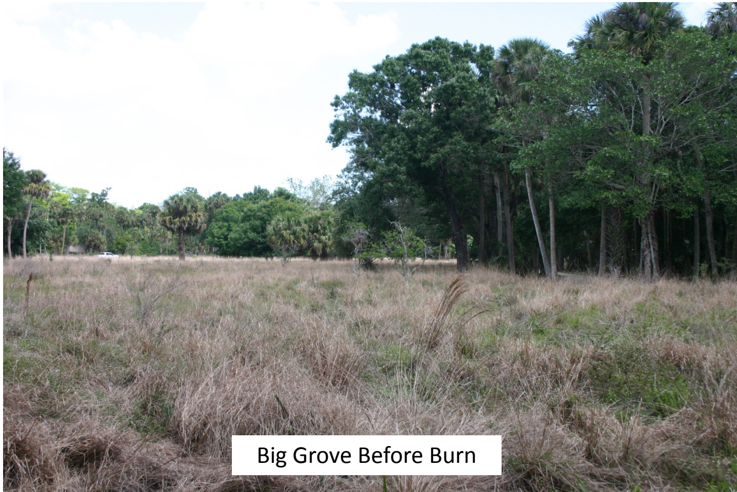
Big Grove Before Burn