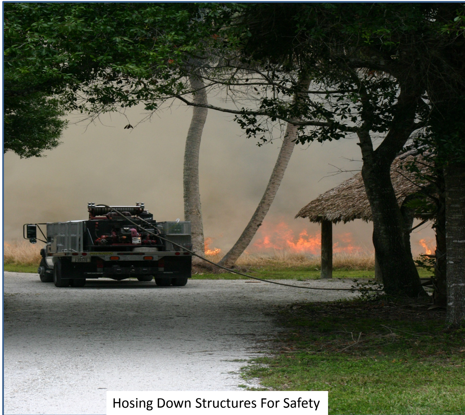
Hosing Down Structures For Safety