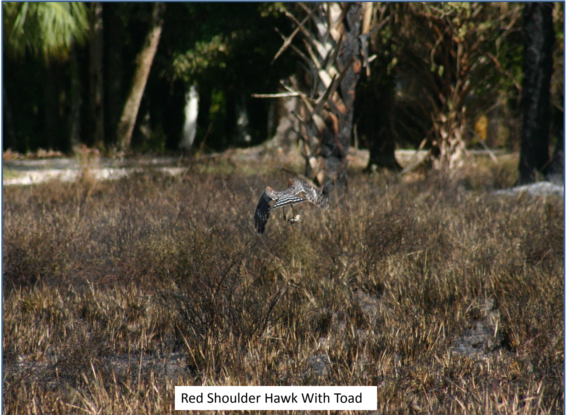
Red Shoulder Hawk With Toad