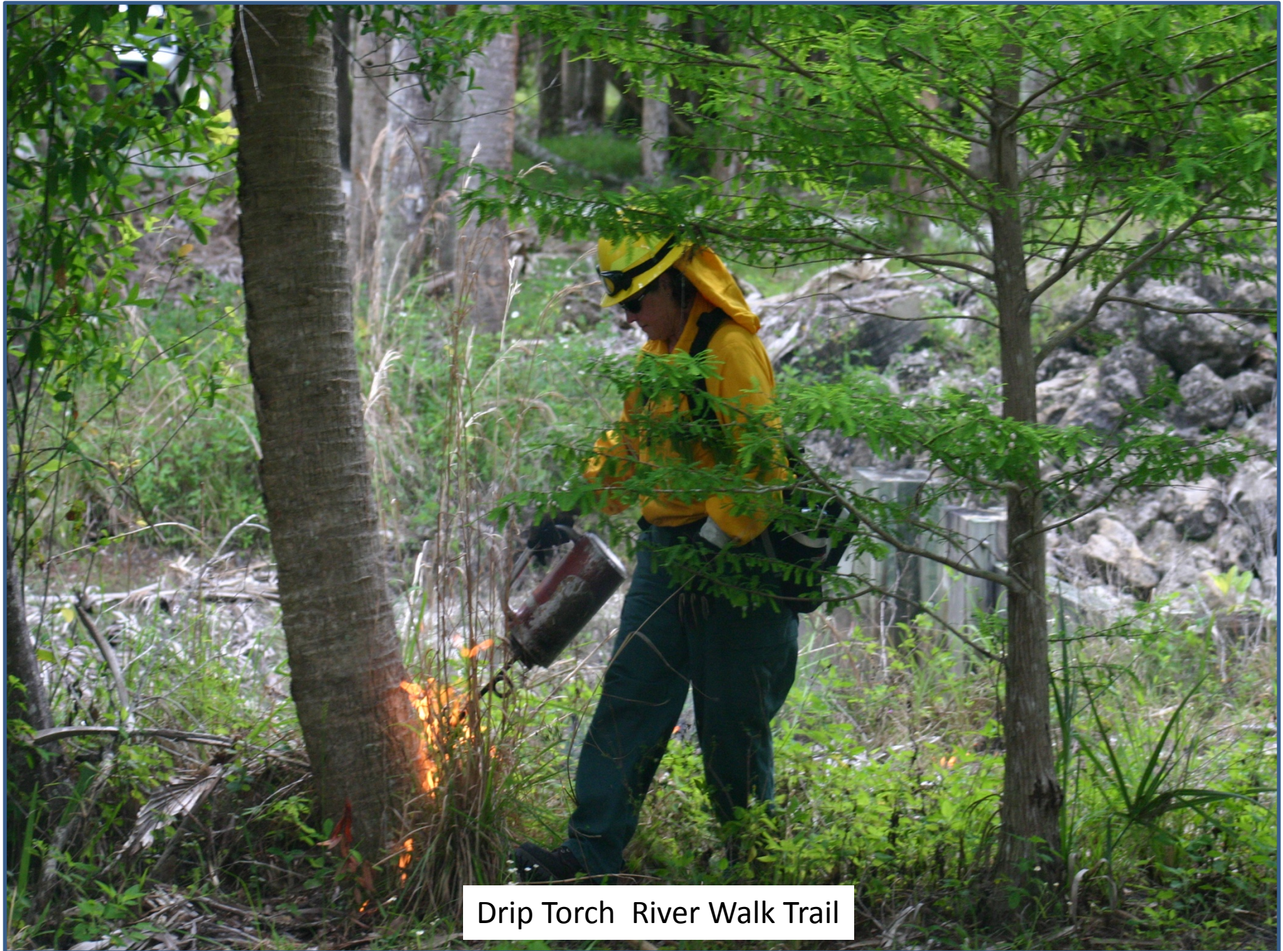
Drip Torch River Walk Trail