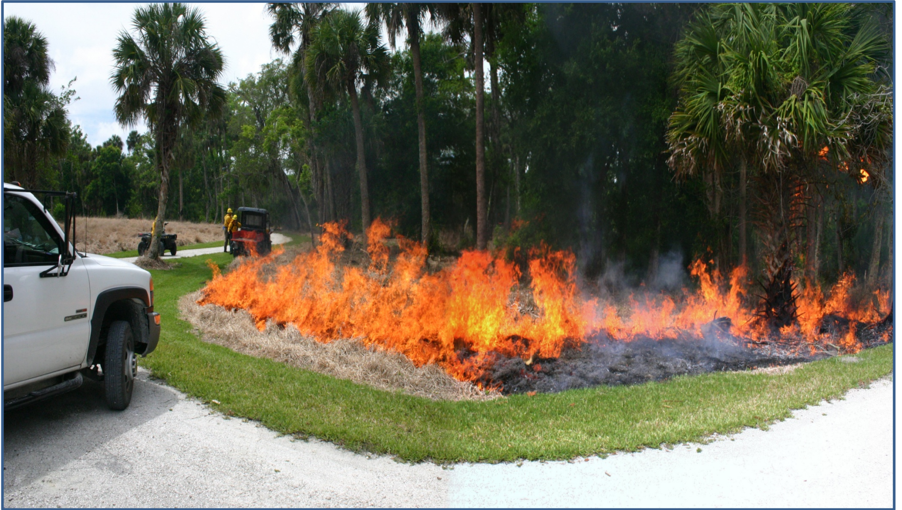
Burning to Exotic Plants