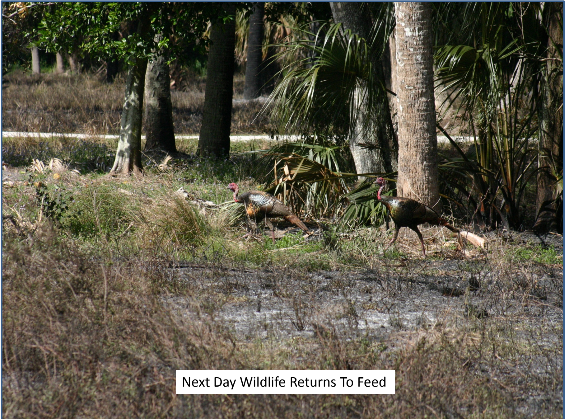
Next Day Wildlife Returns To Feed