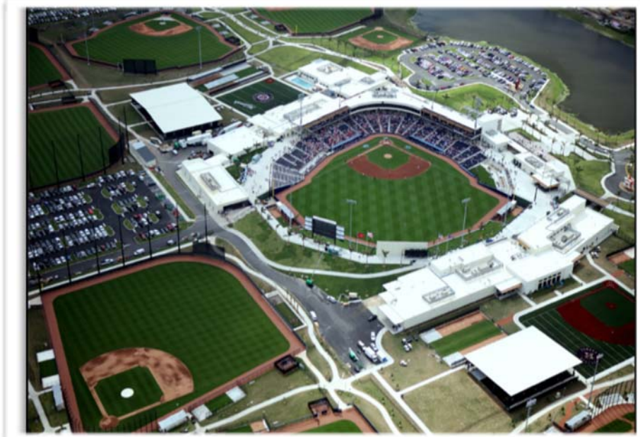
Ballpark of the Palm Beaches