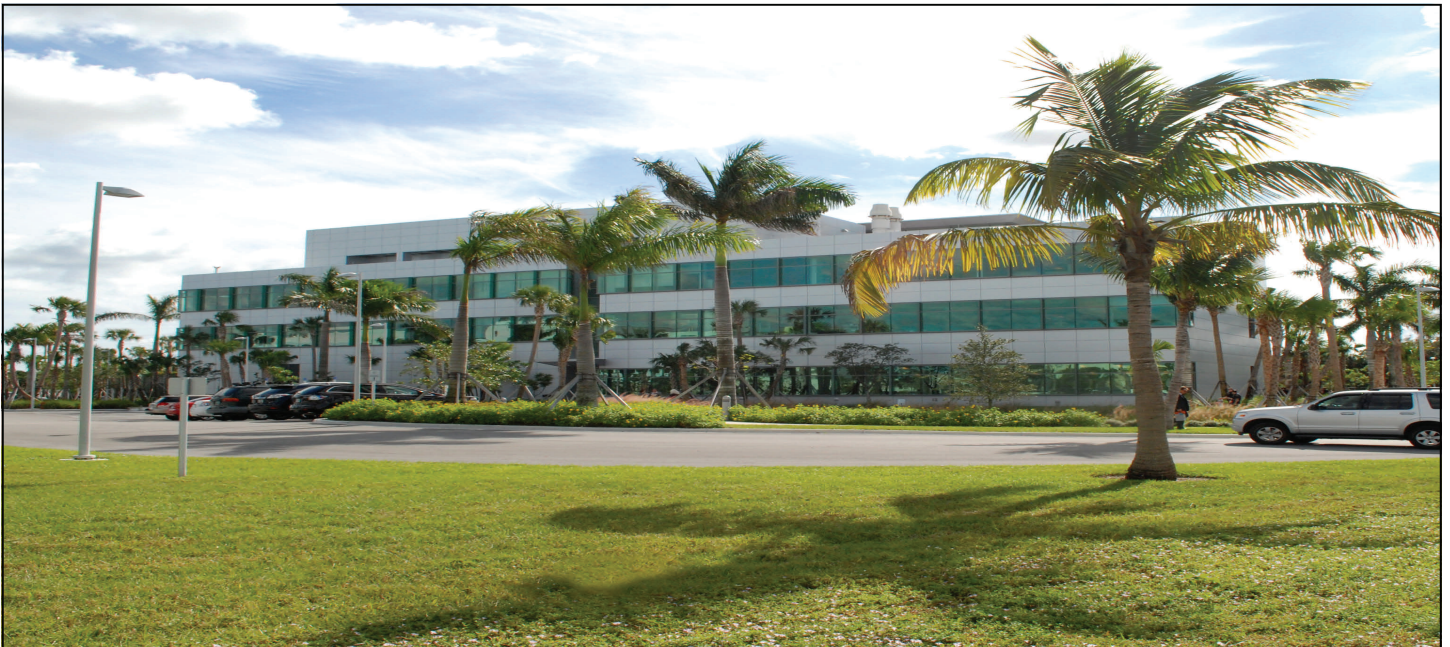
MAX PLANCK FLORIDA INSTITUTE IN JUPITER

Language from this bill was added to the Elections package in HB 7013, which was signed by the Governor on May 21, 2013; Chapter No. 2013-57. The effective date of this law is January 1, 2104.