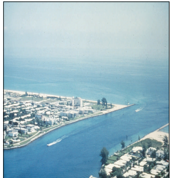
LAKE WORTH INLET

Both HB 543 and its Senate companion died in their respective Criminal Justice Committees.