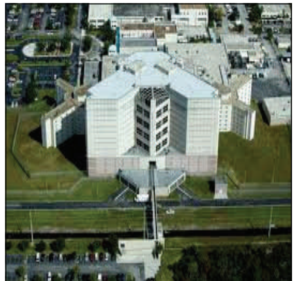
PALM BEACH COUNTY JAIL

This bill was signed by the Governor on May 30, 2013; Chapter No. 2013-090. The effective date was upon becoming law.