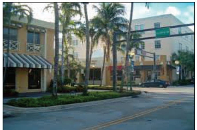
ATLANTIC AVENUE IN DELRAY BEACH