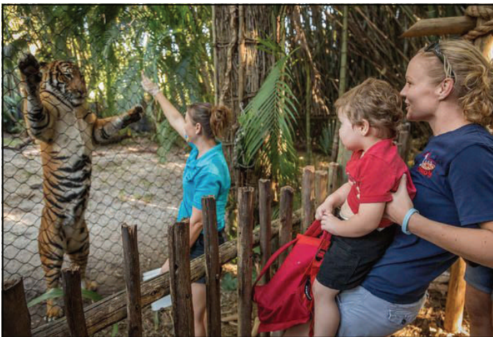
PALM BEACH ZOO

Language in this bill passed in HB 851, which was signed by the Governor on June 28, 2013; Chapter No. 2013-245. The effective date of this law is July 1, 2013.