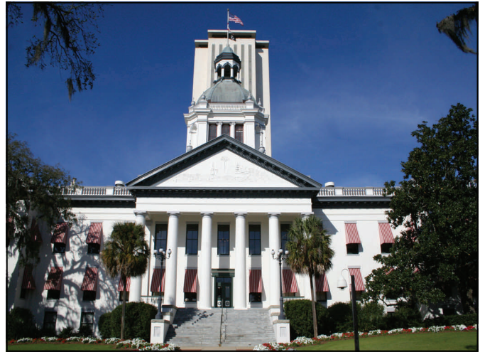
FLORIDA STATE CAPITOL

Healthy Families Subcommittee, Dem. Ranking Member ; Energy & Utilities Subcommittee; Finance & Tax Subcommittee; Joint Committee on Public Counsel Oversight; Rules & Calendar Committee