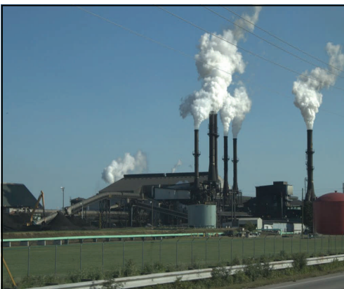
SUGAR MILL IN BELLE GLADE

This bill passed as HB 7083, which was signed by the Governor on June 14, 2013; Chapter No. 2013-216. The effective date of this law is July 1, 2013.