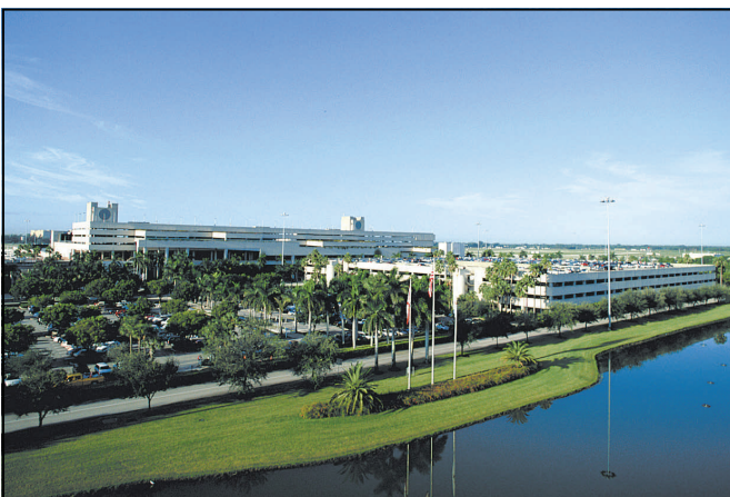
PALM BEACH INTERNATIONAL AIRPORT

HB 1005 passed the House by a unanimous vote, but SB 1376 died in the Senate Community Affairs Committee.