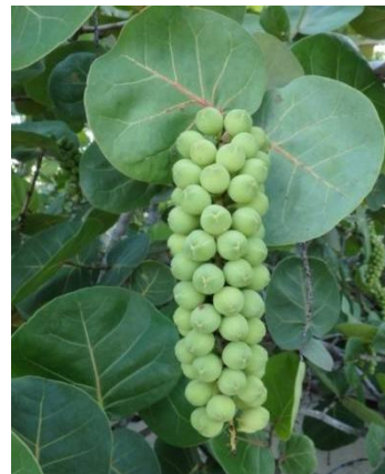
Sea grapes fruit s can be made into jam