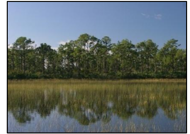
Loxahatchee Slough Natural Area