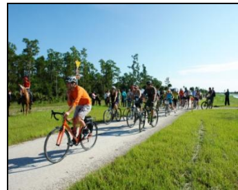
Pântano Trail Opening Event