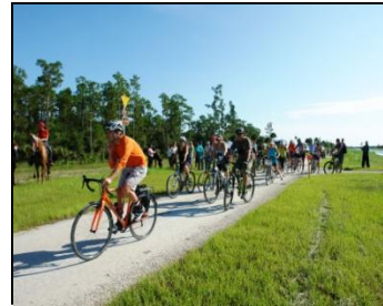
Pântano Trail Opening Event