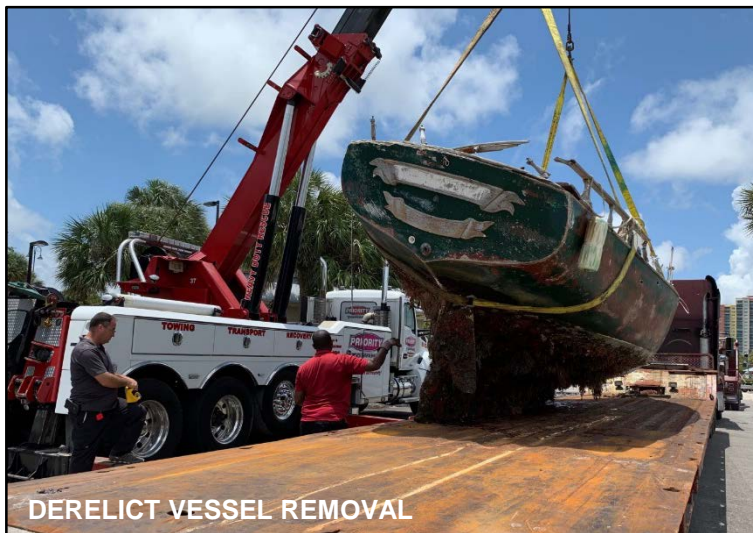
DERELICT VESSEL REMOVAL

Derelict Vessel Removal: A derelict vessel was removed from the north end of Peanut Island in partnership with LagoonKeepers.org. The removal was paid for through Palm Beach County's Pollution Recovery Trust Fund.