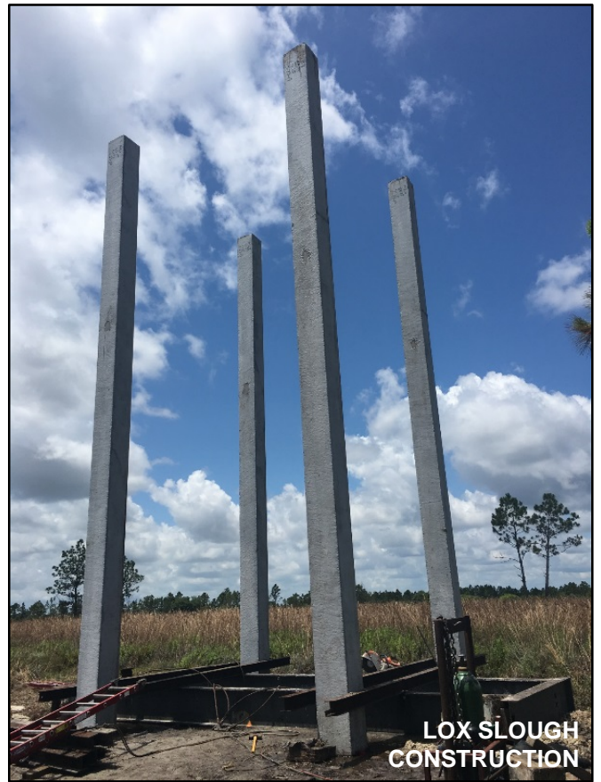
LOX SLOUGH CONSTRUCTION

Nesting Birds: Spring is almost over and with that, an end to the nesting season for much of our local avian wildlife. So far this year, ERM staff have seen owls, woodpeckers, ospreys, swallowtail kites and little blue herons nesting at several natural areas. American oystercatcher hatchlings were spotted at several Lake Worth Lagoon restoration sites, including Snook Islands and Tarpon Cove.