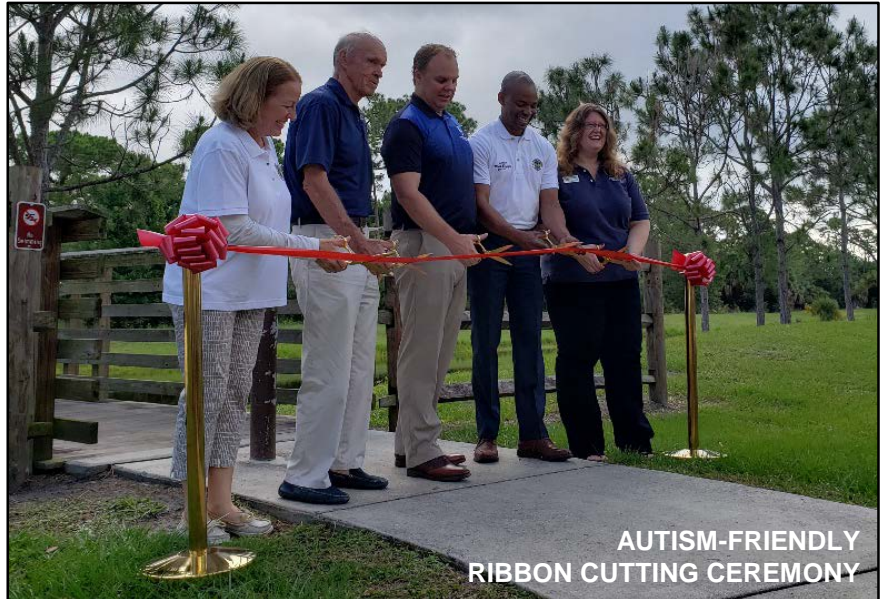
AUTISM-FRIENDLY RIBBON CUTTING CEREMONY

Opening: On May 9 th , a ribbon cutting ceremony was held to announce the certification of North Jupiter Flatwoods Natural Area (NJF) as an Autism-friendly Natural Area by The Center for Autism and Related Disabilities. It is believed to be the first park or open space in the state to receive such certification. The certification was achieved by a partnership between the County's Adopt-a-Natural Area program and The Learning Academy at the Els Center of Excellence. Autism-friendly improvements at NJF include resting benches, signage, fence modifications and sensory touch boards.