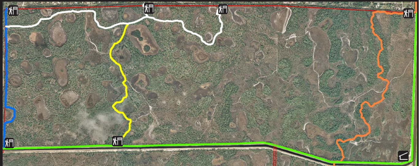
Loxahatchee Slough Trail Map